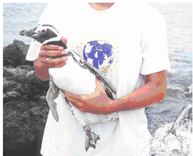
Fig. 2. Recently molted Magellanic Penguin Spheniscus magellanicus captured on 19 March 1998 at Punta Coles, Peru.