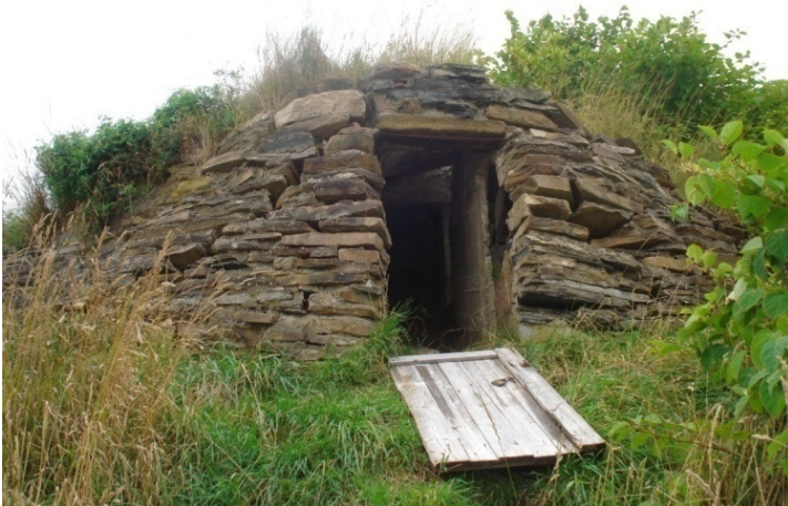
Old root cellar, Norris Point

There are a number of residents who are continuing to garden, as they did growing up, or are beginning to get back into gardening to provide fresh food for their families. There are no large commercial farms around Bonne Bay. The Howell Farm in Norris Point and the Gillam Farm in Woody Point are the two largest farms that sell some foods locally. Most people who grow gardens are growing the food for their own consumption, often citing reasons of freshness and health for growing their own food. They also give some away to neighbours and family. While some residents have some well developed gardens and grow a diverse range of vegetables, there are others that just tend to small potato patches, which they harvest and store for the winter. Many homes have root cellars in which to store traditional vegetables throughout the winter. Many residents also continue to freeze berries, make preserve and jams, and pickle some vegetables.