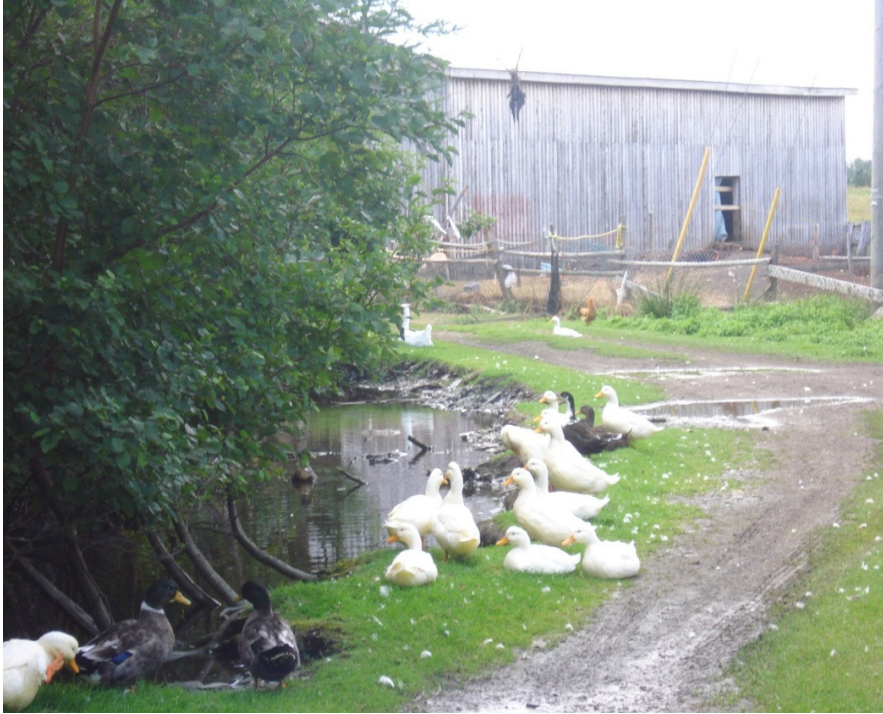
Ren Howell's farm, Norris Point

Barbara Gillam has been farming in Woody Point for approximately 15 years. With help from her husband, they are currently growing approximately a ½ acre of vegetables including potatoes, carrots, beets, onions, corn, peas, lettuce, cucumber, beans, and garlic. Barb sells their produce at the local farmers' market in Glenburnie. They also keep some chickens for eggs, a pig, and a cow for their own family.