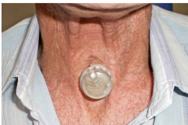
Fig. 1. Voice prosthesis with automatic valve.

geal function, tracheoesophageal puncture with the insertion of various voice prostheses being the most often used. The choice of speech rehabilitation varies from patient to patient, but tracheoesophageal (TE) voice has become the preferred method. Singer and Blom introduced the tracheoesophageal puncture and voice prosthesis in 1979 3 . Since then, general principles remain the same, though numerous variations on the procedure and of the prosthesis itself have been performed 2 . TE fistula formation allows air, initially coming from lungs, to flow through the trachea into the esophagus, while the valve in the prosthesis at the same time prevents entering of food and liquid backwards into the trachea (Figure 1.). The voice is then formed in the vibratory segment of the