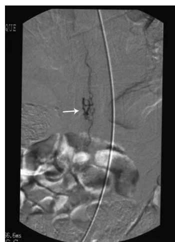
Fig. 2. Spinal angiography demonstrates arteriovenous fistula of the Adamkiewicz artery with extensive ascending and descending venous drainage (2006).