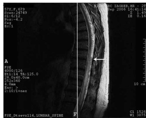
Fig. 4. Initial sagittal thoracolumbar MRI in FSE weighted images demonstrated high signal at the level Th8-th9 and an extensive intradural extradural arteriovenous malformation ascending over the dorsal thoracic cord from Th4-th11.

kle clonus brisk tendon reflexes on both sides. Babinski sign was positive on both side. Bladder felling was present, while there was no bowel feeling. The results of the laboratory processing revealed normal range and results of coagulation studies were unremarkable including lupus anticoagulant, anticardiolipin antibodies, factor V Leiden, PCR analysis for FII 20210A for FV R506Q. Only factor VIII was significantly elevated up to 2.05 IU/L. The results of a cerebrospinal fluid (CSF) evaluation were unremarkable. MRI investigations were conducted with a 2.0 T (GE Medical Systems) and control examination with a 3.0 T imager (Siemens) at the Croatian Institute for Brain Research, School of Medicine, University of Zagreb, Diagnostic Centre »Neuron«. Thoracolumbar MRI (Figure 4, 5 and 6) in T2-weighted images showed high signal at the level Th8-Th9 and an extensive intradural extradural arteriovenous malformation ascending over the dorsal thoracic cord from Th4-Th11. Selective spinal angiography of the radicular arteries from Th4 to Th5 demonstrated very gracile interlaced of abnormal spinal cord blood vessels constituting the discrete pial AVM. As the appearance of the feeding artery and AVM