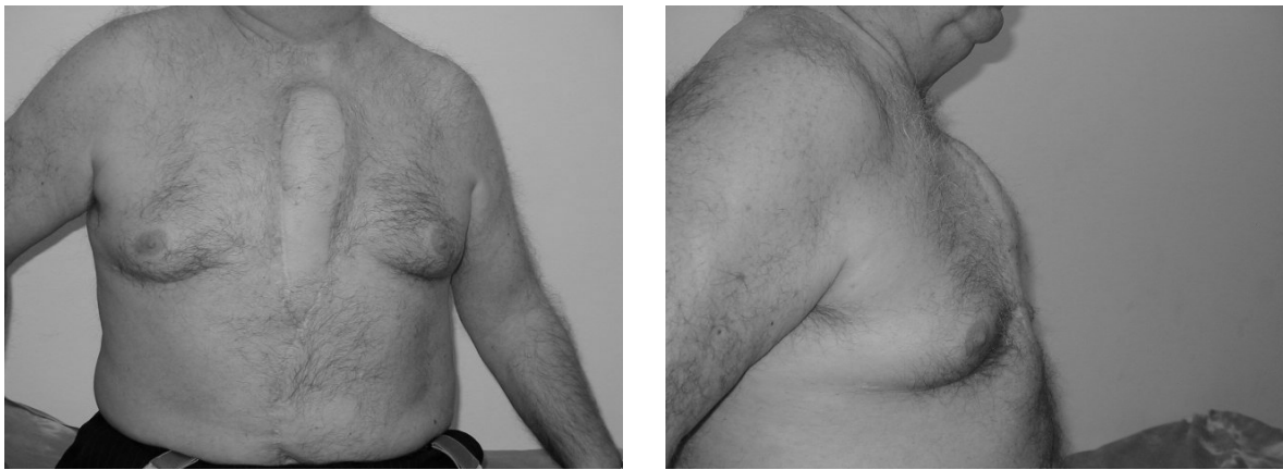
Figure 2. (a) Frontal and (b) side view showing the axillary hollow four years after the sternal reconstruction with a pectoralis major bilateral transposition flap.

Figure 1. Thoracic bulge six years after vertical rectus abdominis musculocutaneous flap reconstruction with the: (a) Frontal and (b) side view. The patient declined proposed liposuction.