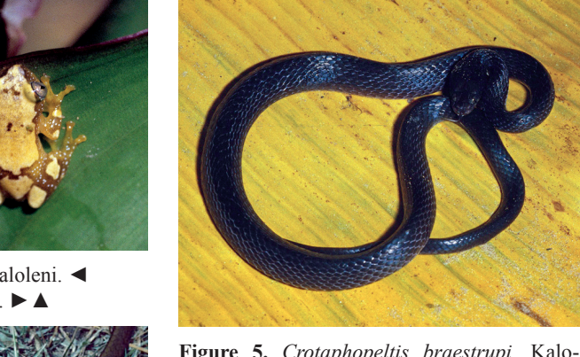
Figure 5. Crotaphopeltis braestrupi, Kaloleni.