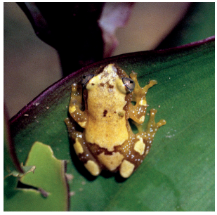
3a. Phrynobatracus ukingensis, Kaloleni. ◀ 3b. Afrixalus sylvaticus, Kaloleni. ▶ ▲