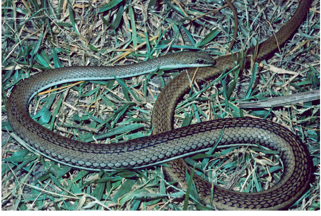
4a. Psammophis mossambicus, Kaloleni. ▲ Figure 4b. Psammophis orientalis, Kaloleni. ▼