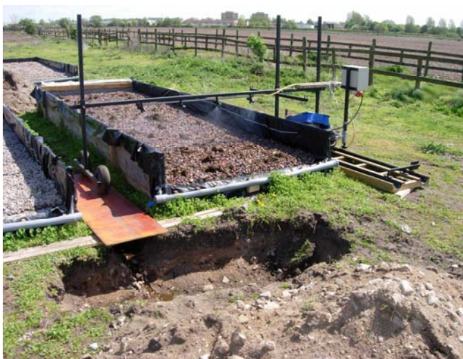
Fig. 2. Rainfall simulator at work

To simulate an outdoor area with cattle manure during a rain storm event a rainfall simulator capable of applying 0-70 mm/hour to one 2 m x 6 m plot at a time was used to generate runoff and drainage effluent from the plots (Fig. 2).