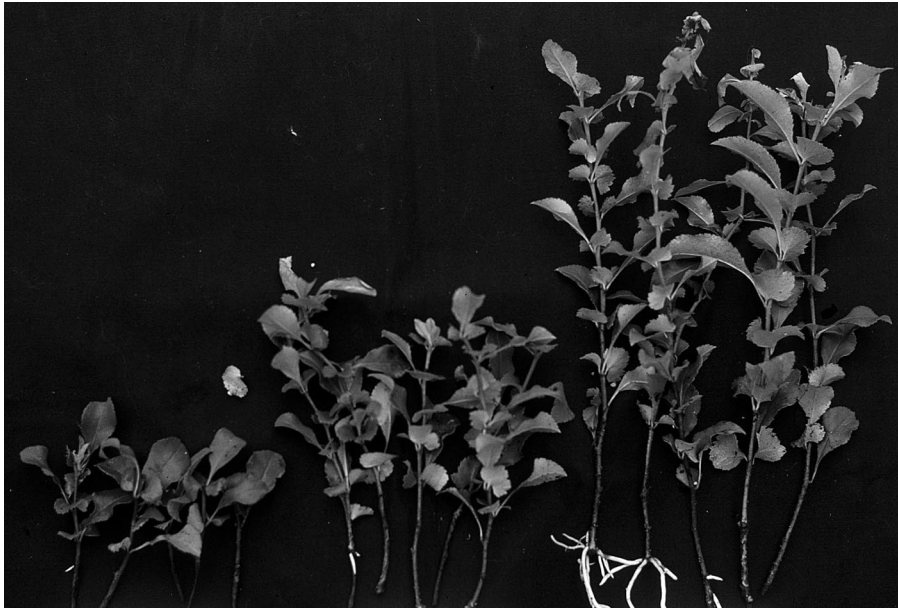
Figure 1. Rooting of Japanese quince ( C. japonica ) softwood cuttings strongly depended on the length of the cutting, and long cuttings (approx. 20 cm) rooted best.

the length of the cuttings is one of the factors that may limit propagation efficiency, since when new varieties are released there is often a shortage of cutting material.