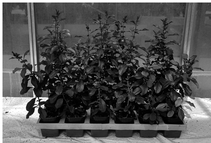
Figure 5. Proliferation of Japanese quince ( C. japonica ) microshoots took place in glass jars with a total volume of 330 ml. Following rooting in Jiffy-7 pots (30 mm) plants were grown in 70 x 70 mm pots.