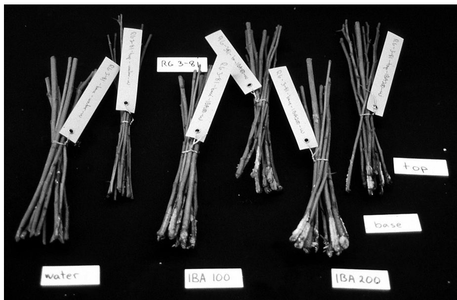
Figure 2. Differences in callus and root formation on hardwood base- and top-cuttings of different Chaenomeles taxa. The cuttings were wounded and then soaked in water, IBA 100 mg/l or IBA 200 mg/l for 24 h. Root induction took place in a greenhouse with low air temperature (4–7 °C) and bottom heat (20°C) for three weeks.

It can be concluded that it is possible to propagate chaenomeles plants by hardwood cuttings, but it can sometimes be difficult. The best rooting percentage was obtained for base cuttings soaked in IBA 100 mg/l. The high frequency of root rot on wounded cuttings soaked in IBA is a major problem that needs to be further studied. No fungicide was used before root induction and storage. A practical way to reduce root rot without fungicides would perhaps be to allow the cutting to root completely before transfer to the cold storage. There is no obvious explanation for the considerably lower rooting percentages in 1999 compared to 1998. Propagation of chaenomeles plants by hardwood cuttings seems therefore unreliable from a commercial propagation viewpoint unless methods are further improved.