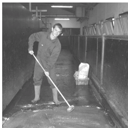
Figure 2. Preparing the walkway with lime powder and slurry

Measurements in Paper II included all parameters mentioned above with the exception of step width and step abduction-adduction. The measurements were taken from four consecutive strides using a ruler and an angle meter (Fig. 4). The measurements and their reference points are described in detail in Paper I. The walking speed of each cow was measured with a stopwatch.