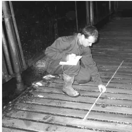
Figure 4. Measuring the trackway

All measurements were made by the author of the thesis (E.T.).