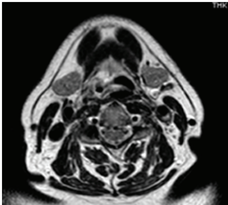
FIGURE 2: MR image shows an irregular area of tissue thickening with moderate contrast enhancement on the right pharyngoepiglottic ligament and omolateral pyriform sinus.

a neoplastic process. Clinical evaluation of the neck did not show lymphadenopathy or skin alteration. Routine blood test evidenced only mild anemia (12,1 mg/dL), and chest X-ray was normal. Neck ultrasound was negative for cervical lymphadenopathies. MR confirmed the presence of an irregular tissue thickening with moderate contrast enhancement on the right pharyngoepiglottic ligament and homolateral pyriform sinus, but the radiologic findings were not specific (Figure 2). In microlaryngoscopy under general anaesthesia, a biopsy of the lesion was performed for histological diagnosis. Histologically a necrotizing granulomatous reaction with central aggregates of neutrophils, forming microabscesses, was observed. Some bacterial colonies were situated inside the neutrophilic collections and they formed characteristic structures that have been called “sulfur granules” (Figure 3). The internal bacteria were also stained with the PAS procedure (Figure 4).