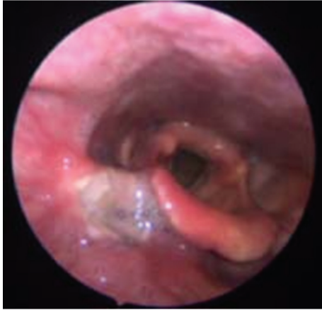
FIGURE 1: Endoscopic view evidences an ulcerative lesion on the right pharyngoepiglottic ligament, homolateral vallecula, and the right pyriform sinus.