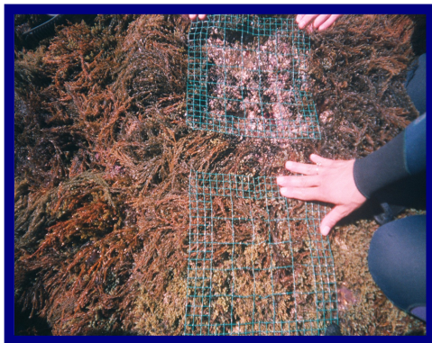
Fig. 1. 20X20 cm quadrats.

At this site 2 areas have been sampled and in each area 5 replicates were taken per Cystoseira species. The percent coverage of benthic species was estimating in the field after canopy removal using a 20×20 cm multiple-scale quadrat (Fig.1). Analysis of similarities (Clarke 1993) was performed on overall abundance of taxa to test for differences among the different assemblages of three Cystoseira species.