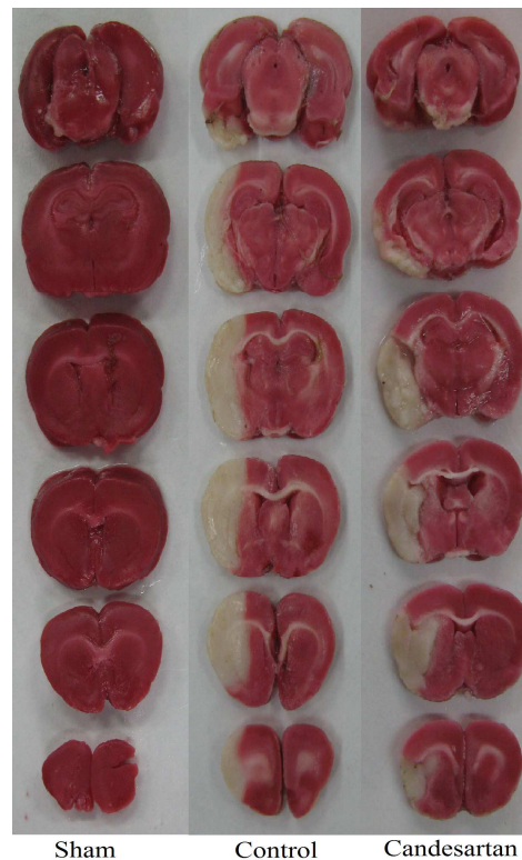
Fig. 3: Representative brain slices stained with TTC in sham, control and candesartan treated rats. Ischemic regions are colored white and non ischemic regions are red.