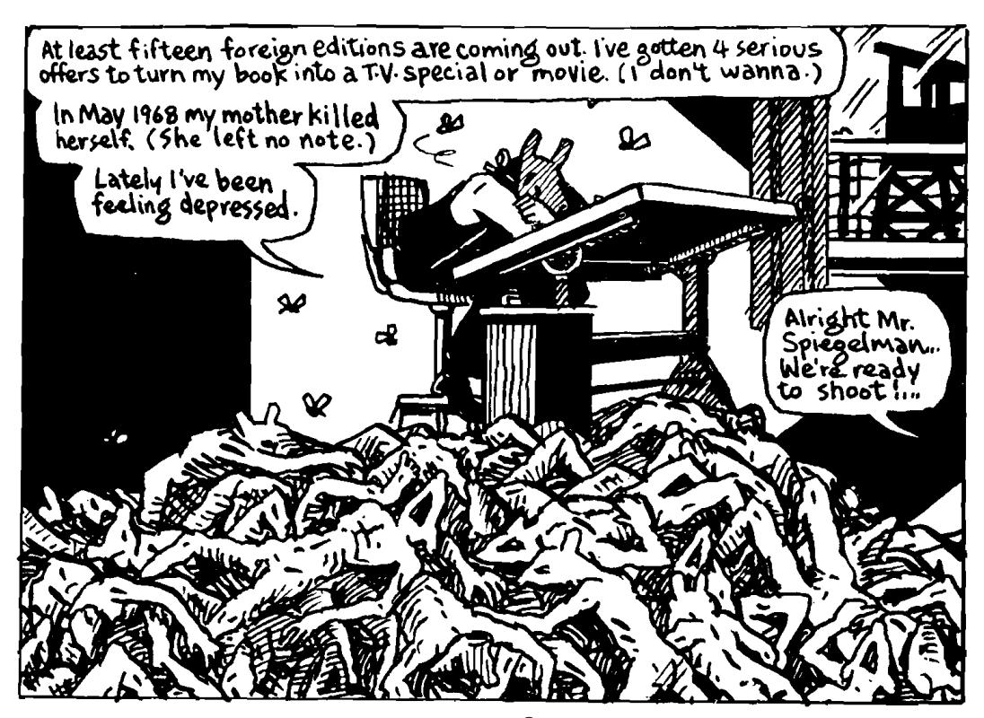
Fig. 3. From Maus\ II by Art Spiegelman. Copyright © 1986, 1989, 1990, 1991 by Art Spiegelman. Reprinted by permission of Random House, Inc.

Through the window of Art's study, we can see the watch tower that also features in Spiegelman's author's portrait on the inner back cover of the book. Symbolized by the pile of dead mouse bodies and the watch tower, the past is lurking at the edges of the presence. With Maus I having become "a critical and commercial success," it seems as if Art has drawn it back into the present rather than written it off his mind: in contrast to traditional Holocaust memoirs that successfully stow the past away as if in a "memory-box," Spiegelman's text constantly toggles between past and present, (his)story world and metatextual level.