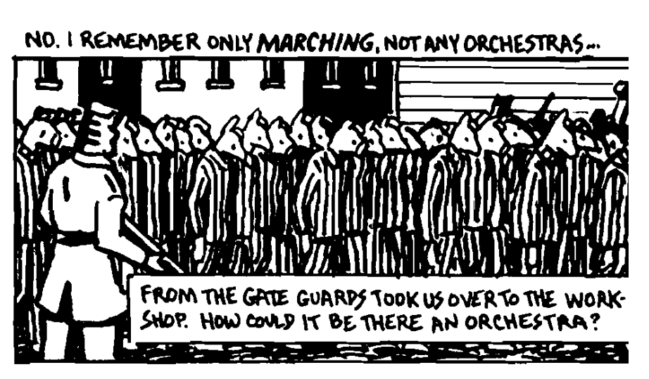
Fig. 4. From Maus II by Art Spiegelman. Copyright © 1986, 1989, 1990, 1991 by Art Spiegelman. Reprinted by permission of Random House, Inc.