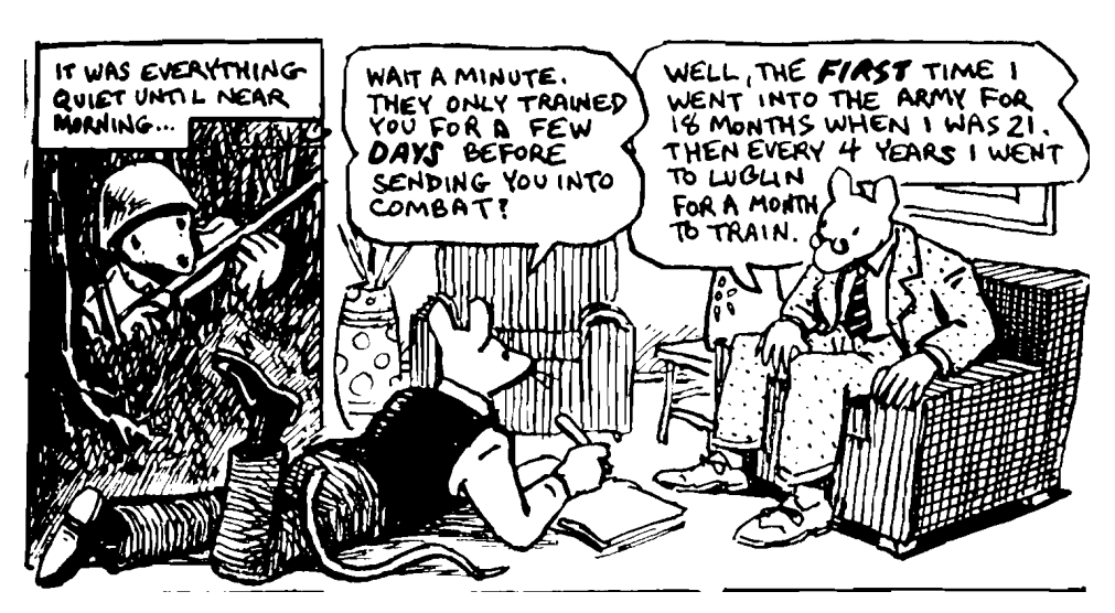
Fig. 1. From Maus I by Art Spiegelman. Copyright © 1973, 1980, 1981, 1982, 1983, 1984, 1985, 1986 by Art Spiegelman. Reprinted by permission of Random House, Inc.

Unlike traditional Holocaust literature such as Elie Wiesel's Night or Primo Levi's If this is a Man , who narrate only the past as if stowed away in a memory-box – to be remembered, but also strictly separated from the present –, Art's present visually touches, reflects on and filters the past, refusing to draw a line between the "then" and the "now."