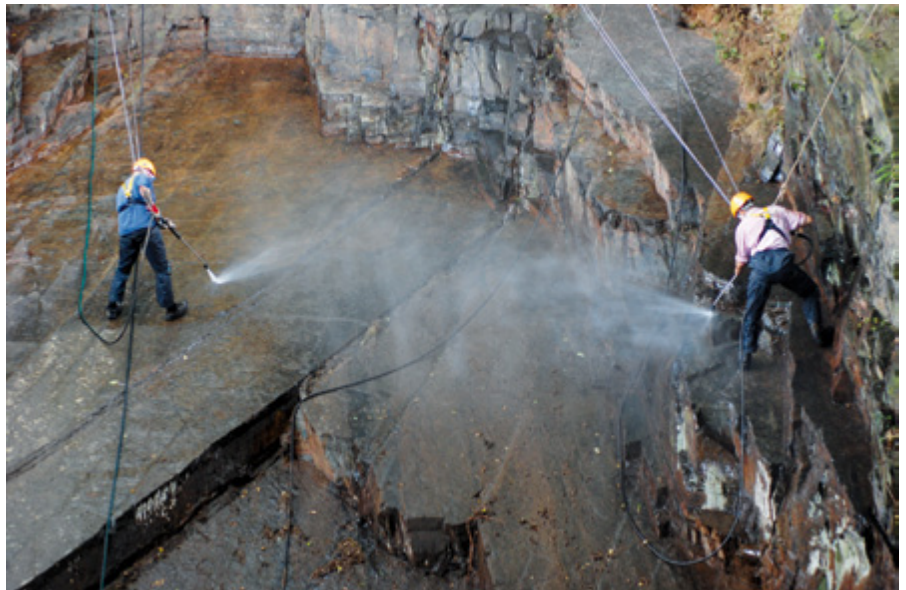
BGS geologists power-cleaning a fossiliferous surface prior to moulding it with silicone rubber. The fossils are virtually invisible in situ and are best studied under low-angle light in the laboratory.

The Ediacara biota dominated the oceans for more than 20 million years but, being entirely soft-bodied, it only left a record at a handful of exceptional fossil sites.