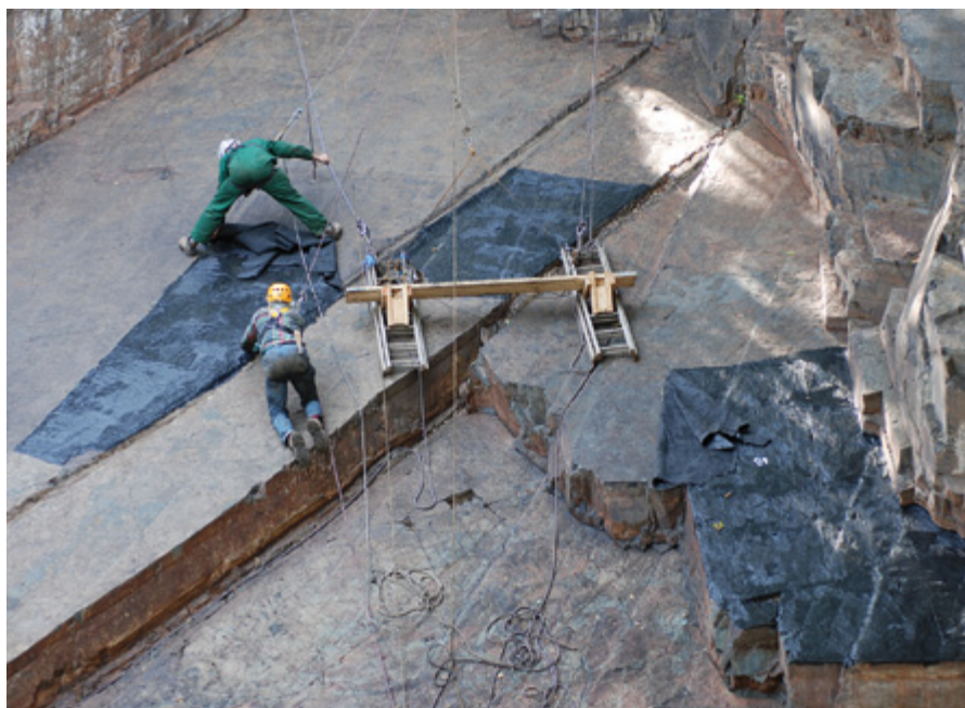
BGS geologists and contractors undertaking the world’s largest single silicone rubber moulding exercise, using more than half a tonne of rubber, and suspended by rope up to 20 metres above the ground.

in the world — has led to the discovery of over a dozen new species, including bizarre feather-like forms which stood more than a metre tall. They lived in deepwater settings on the sides of active volcanic islands where they became instantly fossilised beneath turbulent flows of ash that episodically engulfed the slopes. As a result, entire communities are preserved intact and in situ , revealing every aspect of their structure and development. All the new evidence suggests that these nascent communities, far from being simple, had a complex structure as a result of competition for resources. Many of their occupants have a fractal-like internal organisation which would have acted to greatly increase their surface area and may signal that they made their living by directly absorbing nutrients from the surrounding water column. Similarities between widely separated assemblages suggest dispersal around the oceans via a planktonic stage, while differences imply that ecological specialisation was already well developed more than 560 million years ago.