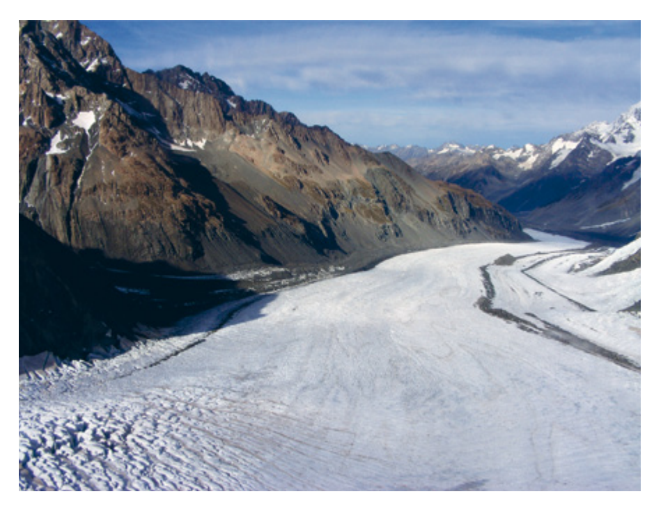
Glaciers, similar to the Tasman Glacier in New Zealand shown in the photo, were part of the landscape of highland areas of Britain until about 10 000 years ago.

Jonathan Lee, BGS Keyworth Tel: +44(0)115 936 3517 e-mail: jrlee@bgs.ac.uk