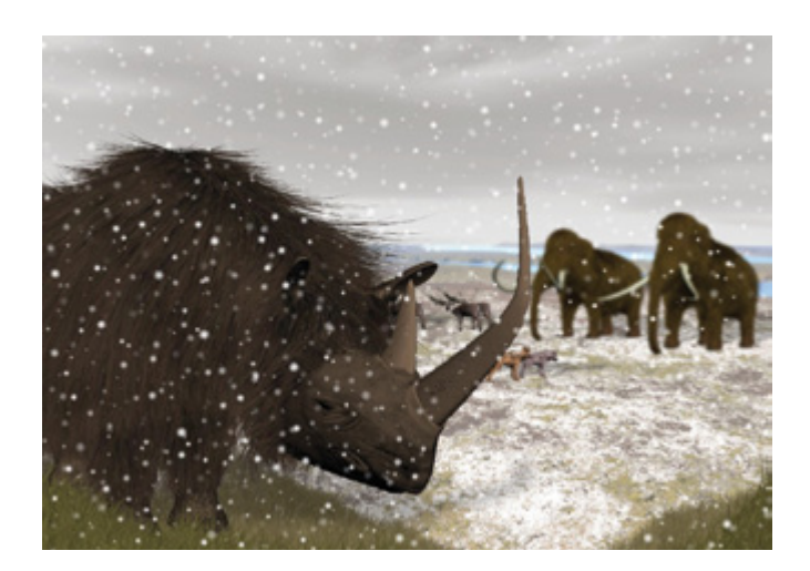
The landscape of the North Sea area during periods of low sea level.