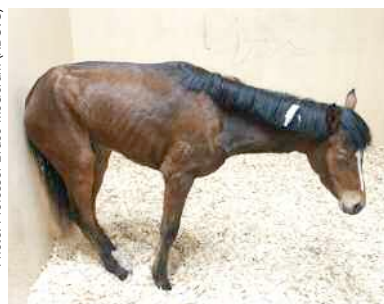
A pony exhibiting the classical clinical signs of equine grass sickness with severe weight loss, a 'tucked-up' abdominal appearance, 'elephant-on-a-tub' stance and depression