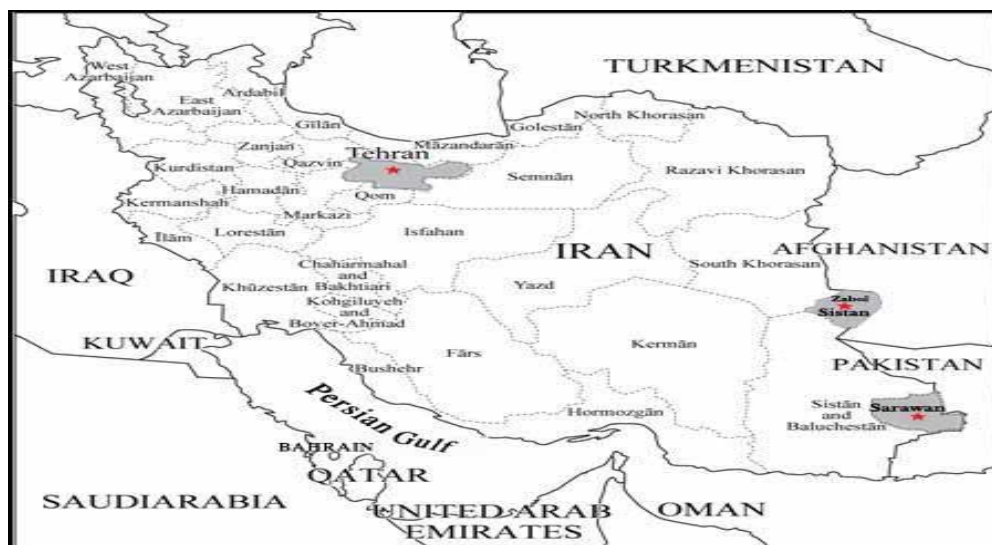
FIGURE 1. The location of Tehran, Sistan and Sarawan in Iran

The article consists of four sections. Apart from section (1) which presented the introduction, section (2) provides a description of phonological systems of SP, CSB and SD. In section (3), first, an explanation about microvariation found in the phoneme system of SP, CSB and SD is given, then, an analysis and a discussion of geographical variation in the syllable structure of language varieties under study will be provided based on OT. Finally, section (4) is dedicated to the conclusion.