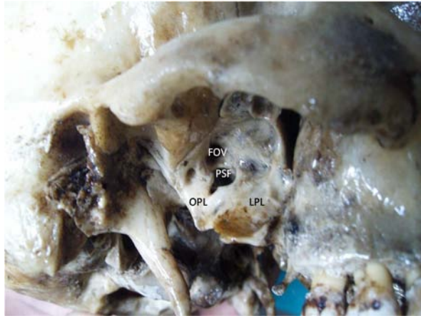
Figure 1: Showing the Right side complete ossified pterygospinous ligament. PSF-Pterygospinous Foramen; OPL-Ossified Pterygospinous Ligament; LPL-Lateral Pterygoid Lamina, FOV-Foramen ovale.