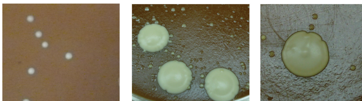
FIGURE 2. Culture morphology of the three strains of BLIS-producing Lactobacillus sp.

Mean diameter inhibition zone (mm): 10-20 mm (positive); <10 mm (negative); 0 (no inhibition)