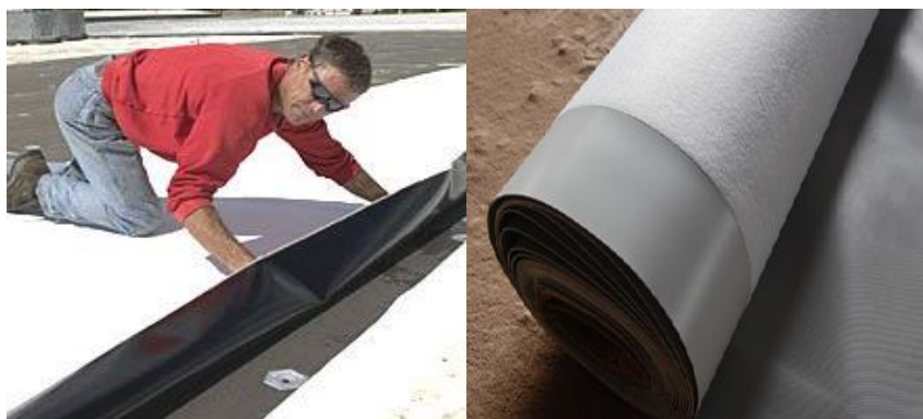
Figure 6 : left: TPO membrane, Right: PVC membrane