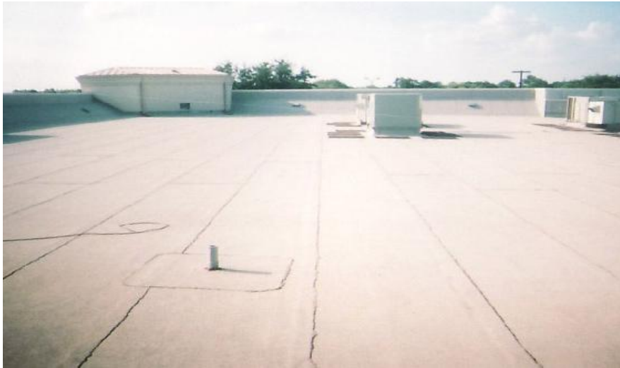
Figure 7: BUR membrane

It is low-cost and poor chemical and oil resistant. It has been low resistant to plant roots and there is needed the root barrier for the project to prevent growing the root in the roof. (Figure 7)