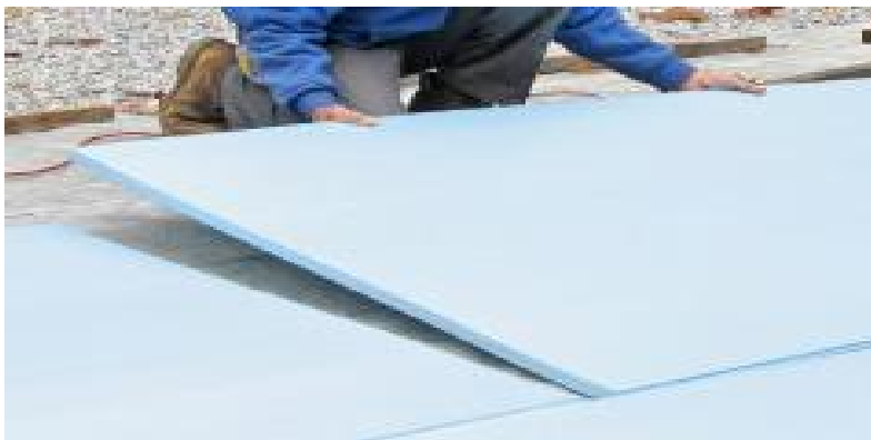
Figure 1 : Polyisocyanurate rigid insulator

It is also referred to as PIR, poly iso, or ISO, is essentially an improvement on polyurethane (PUR). It is the main roofing insulator and typically is informed of foam and used for rigid thermal insulation. It will install before roofing membrane. It should be kept dry and its weight per inch of thickness is 0.2 to 0.3 lb/ft 2 , (Figure 1). There is more detail in British standard BS 4841:2006.