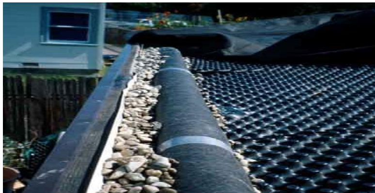
Figure 14: Dimpled mats

Its place is under of growth media, an array of holes, which can be placed of water. Although these are not heavy, for structural design process volume and weight of them should be calculated. Entering of green roof particles to the drainage system and stopping them from doing their work is a problem that can be solved by filter fabrics. (Figure 14). They are very lightweight and usually contain chemical that repel root growth. They can also act as root barriers.