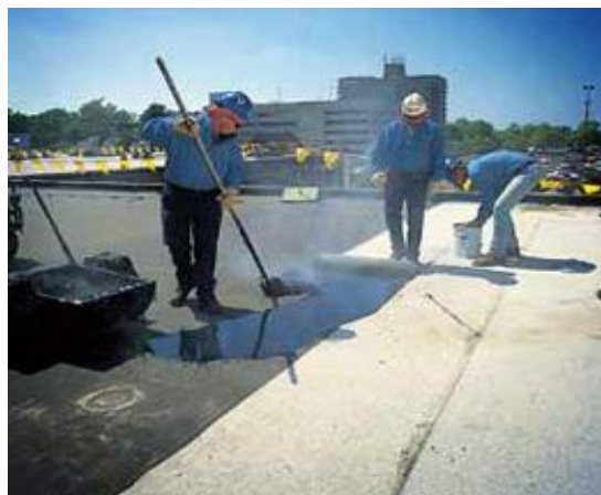
Figure 8 : Modified bitumen Liquid-Applied Membrane

Modified Bitumen is low cost membrane, and it is usually used for BUR systems. It has been poor resistant to chemical and oil. Common thickness weight is around 1 to 1.75 lb/ft 2 . (Figure 8)