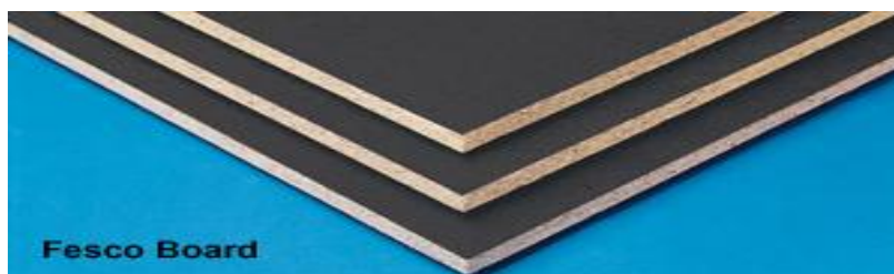
Figure 4 : Fesco board

Fesco Board is a homogenous insulation board that is usually used as fire resistant. It can resist damages that come from construction and maintenance. It must be kept dry and its weight per inch of thickness is 0.77 lb/ft 2 , (Figure 4). Fesco board meets the physical requirement of ASTM C 728.