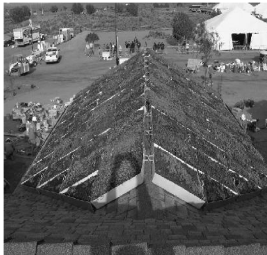
Figure 15: Final Slope Roof (Lockett, 2009)

As mentioned earlier insulation layer is part of every building structure project. It can be applied under or above roof materials. In many green roofs, projects are using polyisocyanurate which is rigid and must be kept dry. So it should be installed under the roof materials. If extruded polystyrene is used as insulation material, it can be used as impervious and water proof material. The walls and curbs can be covered with an insulation layer too.