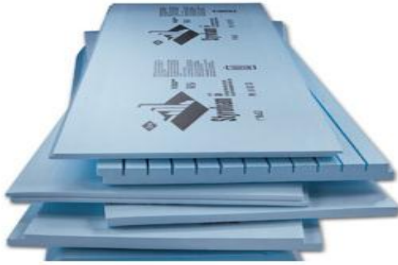
Figure. 2: Extruded polystyrene