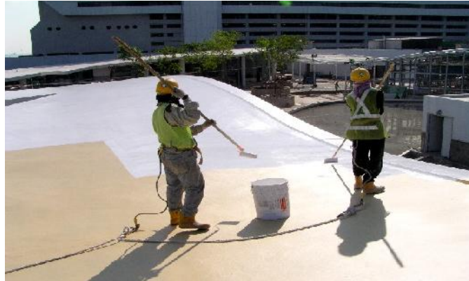
Figure 9: liquid applied membrane

Liquid applied membrane is becoming a popular choice for roofs, and it does not need flames or other heat sources. This kind of membranes is based on flexible thermo set resin systems such as polyester or polyurethane. Its weight with common thickness is 0.75 to 1.5 lb/ft 2 . (Figure 9)