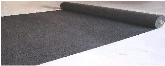
Figure 13: Geo-textile fabrics