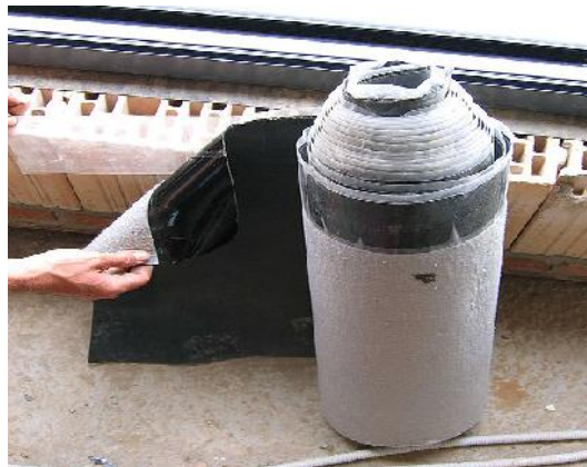
Figure 5 : EPDM membrane

TPO and PVC membranes are thermoplastic membranes with good chemical and oil resistant. The surfaces of them are in white color, and they are durable membranes. According to 45 mil, 60 mil and 80 mil thickness the weights are (0.232 lb/ft 2 ), (0.314 lb/ft 2 ), (0.42 lb/ft 2 ). (Figure 6)