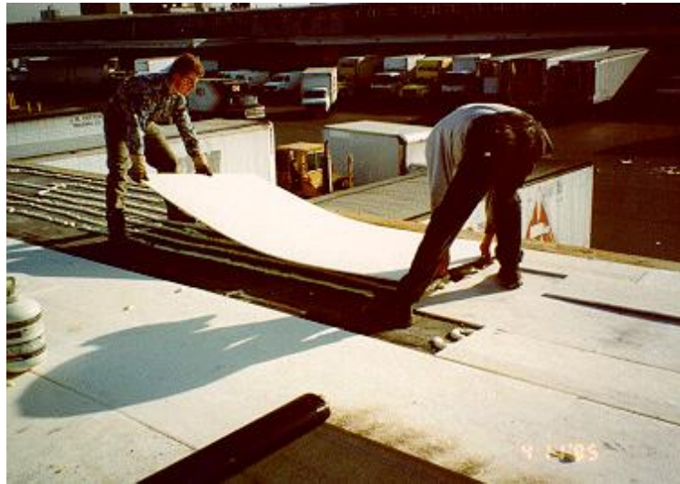
Figure 11 : Gypsum board

Gypsum-based cover board is a highly mold resistant roof panel and consists of a moisture-resistant, non-combustible core of specially treated gypsum with glass mat facings. It delivers the highest performance ratings for fire, strength and moisture resistance. It protects the insulator from heat and chemicals during adhering to the insulation layers. Because of applied weight over green roof beneath and fasteners it should be used to prevent damage to roof membrane. The three most common thicknesses are 1/4-inch (1.1 lb/ft 2 ), and 1/2-inch (1.95 lb/ft 2 ), and 3/4-inch (2.5 lb/ft 2 ) as shown in Figure 11.