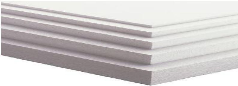
Figure 3 : Expanded polystyrene

It is usually in white color with low density and low thermal conductivity, which is another type of polystyrene that should be installed, bellows the roofing membrane. It is introduced in BSI standard number BS 3837. It also used for packaging industry. It should be kept dry and its weight per inch of thickness is 0.1 to 0.2 lb/ft 2 , (Figure 3 )