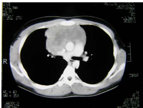
Figure 1: CT of thorax showed an anterior mediastinum mass with a diameter of 6x10x11cm that abutted the great vessels and posteriorly displaced and compressed the SVC.

Neoadjuvant chemotherapy was started to improve resectability of the tumour mass. A chemotherapy protocol containing cisplatin (50mg/m 2 /day, for 1 day), cyclophosphamide (500mg/m 2 /day, for 1 day), and doxorubicin (50mg/m 2 /day, for 2 days) was given and repeated every 21 days. After 3 cycles of chemotherapy,