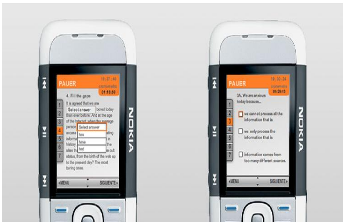
FIGURE 3. Adaptation of the different types of question for ESP testing and m-learning. Multiple choice tasks.