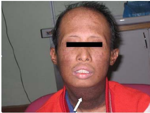
Figure 3: Radiation-induced cutaneous reaction with inflamed skin, hyperpigmentation and areas of skin breaks in the neck after completion of treatment.

the tumor recurred and the patient died 16 months after diagnosis of SCC.