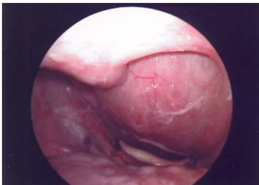
Figure 3: Laryngoscope view demonstrating bulging of posterior pharyngeal wall in one of the patients. The swelling is obstructing the laryngeal inlet.

The use of antibiotics has modified the presentation of deep neck space infections. Most of the patients who presented with deep neck space abscesses had already received some form of antibiotic therapy as an outpatient. Signs and symptoms of infection could be masked.