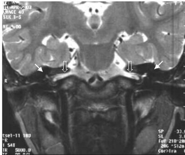
FIGURE 3: A coronal T2-weighted MRI (case 2) shows hypointensity of the labyrinthine structures bilaterally.