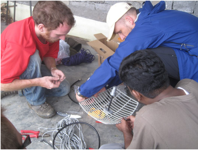
Figure 5: Participants assembling one of the AirJaldi network installations at ExtremeCom 2010.

to a number of trekking trails, going through beautiful, but challenging, nature into remote areas where no traditional infrastructure is available. Dharamsala provides a dynamic environment where locals mix with tourists that visit because of the great trekking opportunities or because of the Dalai Lama. The presence of the Dalai Lama and the exiled Tibetan government in this area also means that there is a large Tibetan community here.