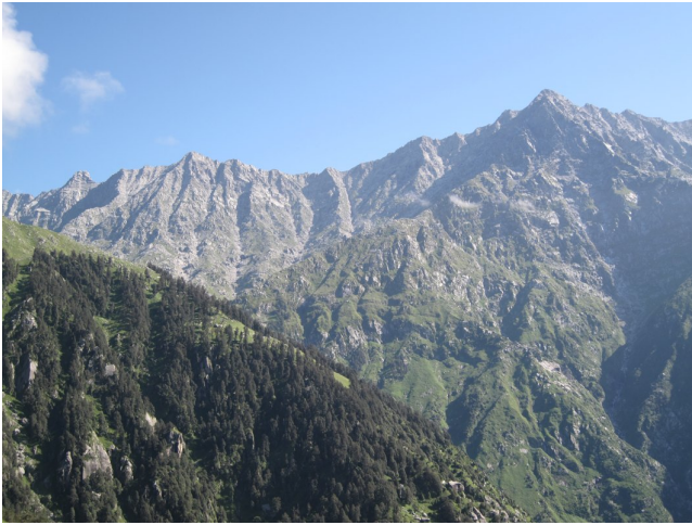
Figure 7: Indrahar pass – the highest point of the ExtremeCom 2010 hike.

WiFi networks, people with mesh network deployment experience, etc. This also spurred many interesting (and sometimes heated) discussions about slightly different topics, and also different approaches to solving similar problems. This mix of people with different view on the topics being discussed was highly valuable in order to provide a “reality check” for everybody to think once more about their own research and consider whether or not it has potential for real impact.