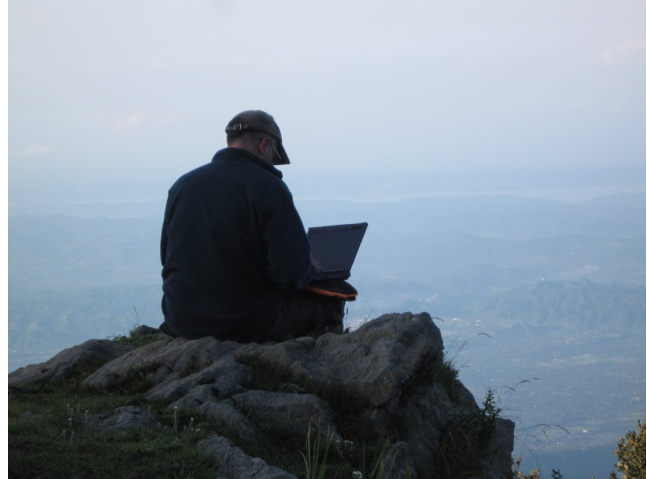
Figure 8: Trying to access WiFi network from Dharamsala while at Triund in the mountains.

The village of this school had no prior Internet connectivity, but now the school is connected, which also makes the additional cost of connecting other parts of the village smaller. As a way of giving back to the local community, these installations connecting the school was funded by part of the workshop registration fee.