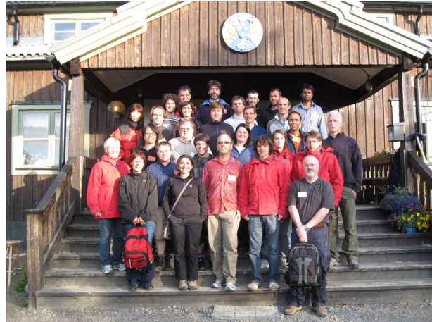
Figure 3: All participants at ExtremeCom 2009.

ExtremeCom 2010 had the theme The Himalayan Expedition and was organized in and around Dharamsala in the Indian Himalayan region of Himachal Pradesh. Dharamsala is located in the Himalayan foothills and is the starting point