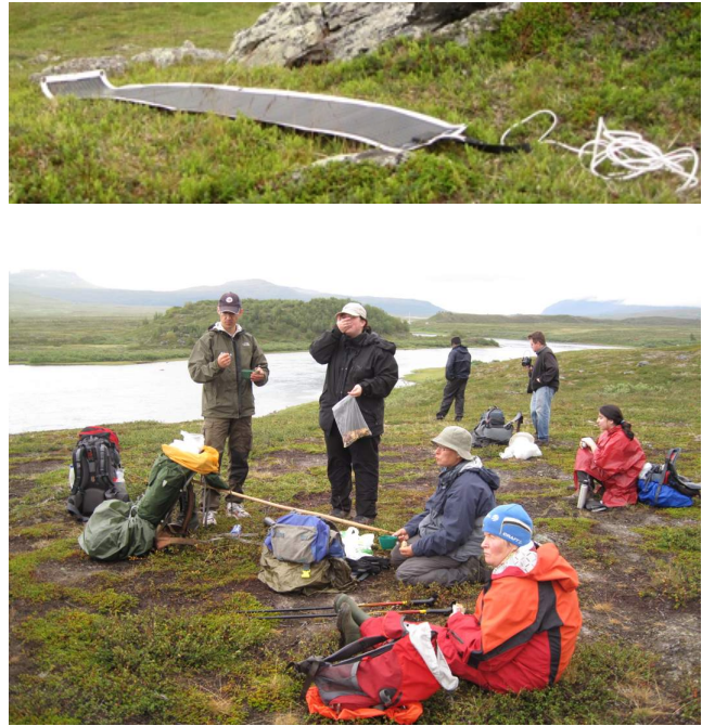
Figure 2: Top: Harvesting power with solar panels during one of the stops during ExtremeCom 2009. Bottom: Resting from the hiking.

ExtremeCom 2009 was arranged in the Padjelanta national park in Lapponia, Sweden. The Padjelanta national park in Lapponia, Sweden is the home of the Saami population of semi-nomadic reindeer herders. The Saamis try to preserve the traditional ways of life as reindeer herders, partially relocating over the year as the reindeer moves. It is however hard to make a sustainable living solely from the reindeer herding business, so most Saamis also live a modern life in nearby cities or villages. Thus, they have a need to communicate with the outside world even when they are in the mountains with the reindeer in order to maintain business relations, family contacts, educational resources for the children, and for many other reasons as well. Due to the lack of infrastructure in this area (and the fact that it is a UNESCO World Heritage site, so large antenna towers or other invasive infrastructure cannot be installed), a DTN-based networking system for the area has been developed by