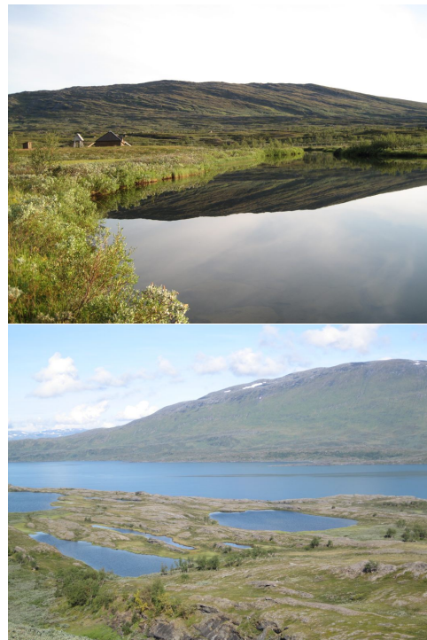
Figure 4: Views over lakes during ExtremeCom 2009.