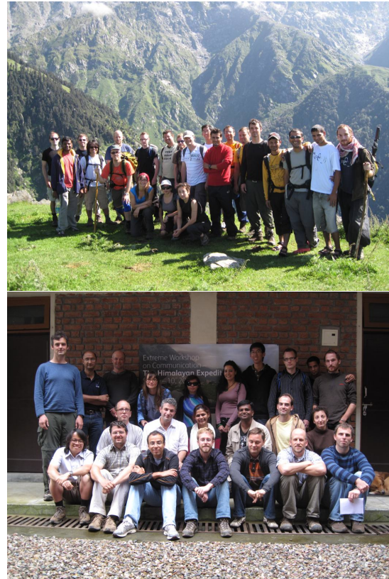
Figure 6: ExtremeCom 2010 participants.

tors, several people working with logistics such as building our camps and providing food, and several mules to carry equipment for us) that joined for the hike, and 27 people that took part in the technical workshop (plus some locals sitting in on some sessions). The local arrangements were done by the AirJaldi.org organisation and they did an excellent job with everything, from food, workshop pack with some local souvenirs, hike arrangements, travel arrangements, and anything else that anyone needed help with on the fly.