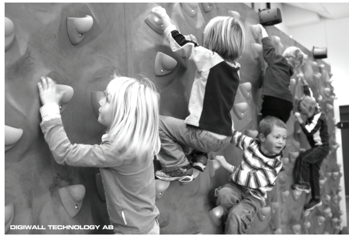
Figure 2. DigiWall climbing wall computer game interface

Both projects explored questions related to how computer game players could be offered new and unique gaming experiences in terms of freedom and fantasy. In Beowulf the hypothesis was that a shift in balance between eye and ear would invite the players to co-create the game experience and to bring their imagination into play in new ways, compared to traditional, graphics-based games. The studies performed on the game concept showed that, to a majority of players, this was also the case. The DigiWall concept is based on the players' freedom to use their whole bodies and to play the games by moving over the whole, 15m 2 game interface. The absence of a traditional computer monitor also opens up the rules of play in such a way that the users are invited to co-create and adapt the basic gameplays offered to their own needs and desires.