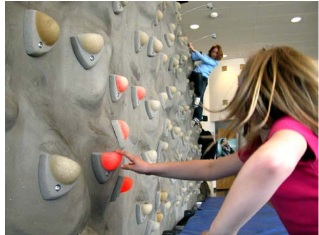
Figure 2. Two girls playing Catch The Grip

defined by a straight line between the lowest grip the player is standing on and the highest grip she is holding on. The ball is denoted by lit grips. The speed of the ball depends on the length of the paddle it bounced on last. If the ball bounces on a short paddle, it gets a higher speed than if it bounces on a long paddle. Each time the ball bounces a sound is played. The speed of the ball is marked by the pitch of that sound, higher speed gives higher pitch. The first player to score five points wins.