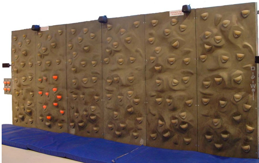
Figure 1. DigiWall prototype 1

1 Sonic studio, Interactive Institute, Acusticum 4, SE-941 28 Piteå, Sweden