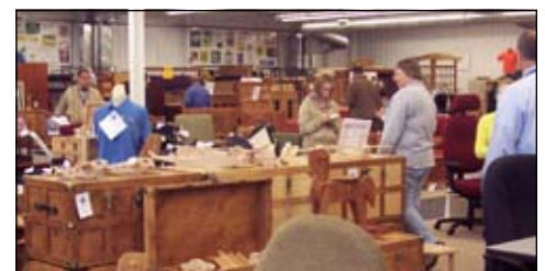
The open house drew visitors from the Capitol Complex and other Central Iowa organizations.