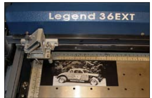
The laser engraving machine can produce near photo-quality pictures on a variety of surfaces.