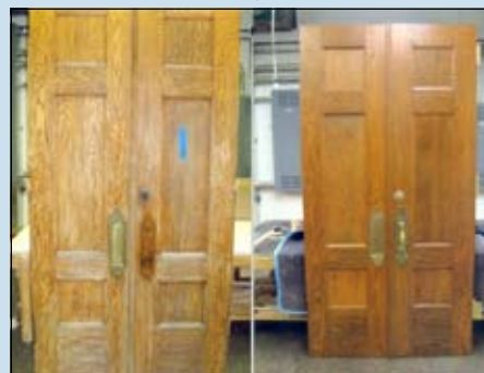
Before and after pictures of original doors the Custom Wood shop refurbished for the Carnegie-Stout Library in Dubuque.

"If you don't go after what you want, you'll never have it. If you don't ask, the answer is always no. If you don't step forward, you're always in the same place." -- Nora Roberts