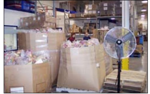
These photos show the large amount of product that went out during the week of Christmas.

Needless to say, it was a harried week for all involved; but staff and offenders put forth the extra effort needed to accomplish what was required. All of the special Christmas gift bags were delivered by Christmas Eve in a monumental effort that brought satisfaction of a job well done.