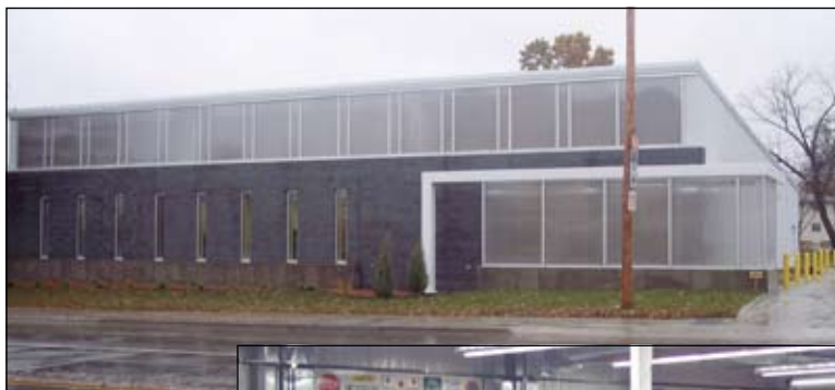
The new IPI Showroom is located at 1445 E Grand Ave. in Des Moines, just 2 blocks east of the Capitol Complex.