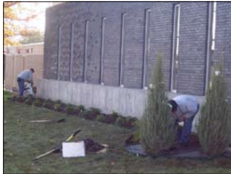
Above: Landscape installation. Below: Modular office installation.

Over all, the MMI portion of the project went very well, and it was actually a lot of fun working on projects that this