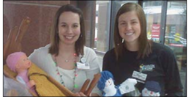
Above: University of Iowa Children's Hospital staff were thrilled to receive dolls, doll cradles and wood trucks from IPI Fort Madison & Iowa State Penitentiary. Below: Dolls and wood trucks for the Fort Madison Community Hospital.

The offenders have been very creative and imaginative trying to come up with new ideas and variations on the novelty items. They are excited to put their new ideas into production. Some of the new items include a large wagon planter, garden corner trellis with seat, rolling dogs, rocking zebras, rocking elephants, rocking boxer dogs, doll cradle with seat, a pie safe, magazine rack, trunks, cedar chests and dolls just to name a few. You can view