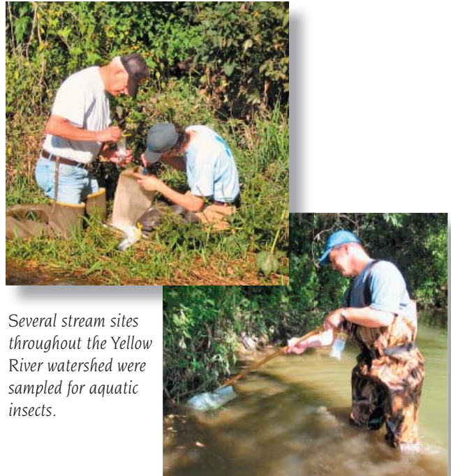
Several stream sites throughout the Yellow River watershed were sampled for aquatic insects.

The condition of Iowa's water quality is a dynamic phenomenon. Water quality constantly changes as the forces that shape it – rain, sunshine, biological and human activity – shift and change. Monitoring