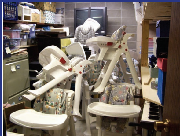
The center stopped using the 18 high chairs as soon as it was discovered they had been recalled.