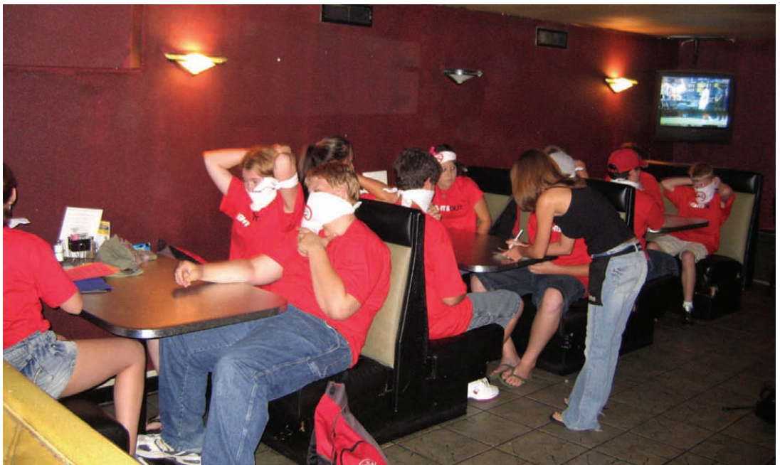
Members of JEL, the youth-led anti-tobacco movement, occupied the smoking section of four restaurants in Iowa City during the Lights Out Summit.

The summit also included presentations by Andy Berndt and Nic Buron of Minnesota's former anti-tobacco program, "Target Market." Their messages inspired youth, and let them know their pas-