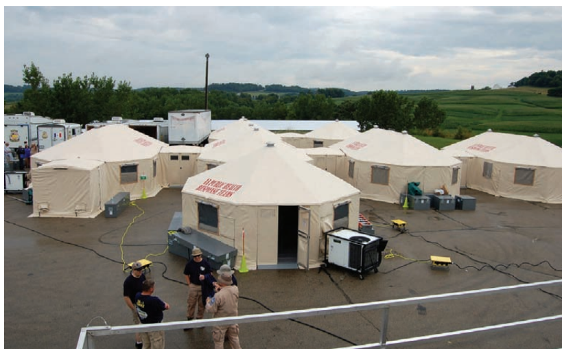
The new Mobile Health Care Facility consists of seven structures that can be connected to one another or used separately.

This scenario describes just one of the many uses for Iowa's new Mobile Health Care Facility (MHCF). Recently purchased by the Iowa Department