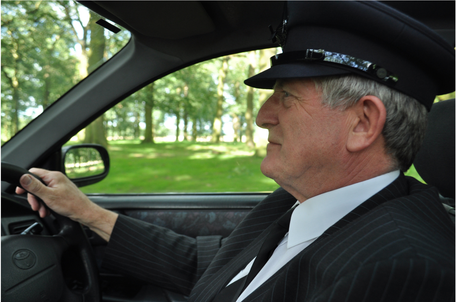
Image 4: Ghost , 2010. Detail of chauffeur. Intervention over the duration of the Tatton Park Biennial.