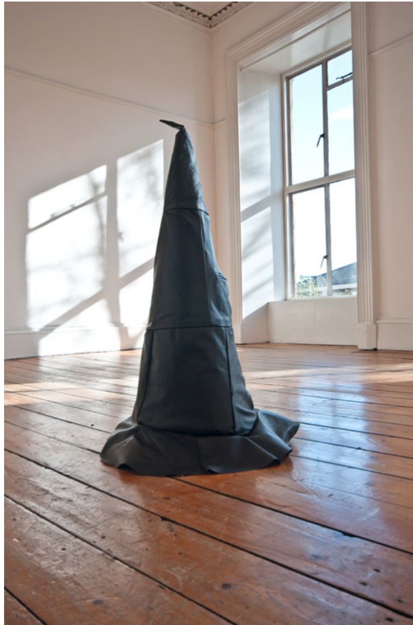
Image 9: Birch Bitch , 2010. ( Scent, robotic vacuum cleaner, old leather jackets ) A witches hat, sometimes static, occasionally wakes up and moves around the room as if it has a life of its own. At times it is absolutely still, and uncannily starts to move, bumping into other artworks, the audience, furniture and walls in the gallery/domestic Space, moving from room to room. It smells like it is burning.

Shown in group show Another Opening , at Nomi's Kitchen, Glasgow Part of Glasgow International Festival of Visual Art