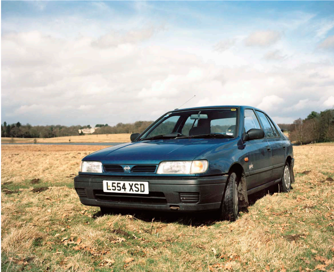
Image 3: Ghost , 2010. Intervention over the duration of the Tatton Park Biennial.

A re-branding of an old, unwanted mass produced car with the scent of a luxurious Rolls Royce offered as a chauffeur driven taxi service within Tatton Park Estate. The original car for the work was stolen 8 days prior to the opening. It was a 1994 Nissan Sunny, and was replaced with a Toyota Carina from the same period. The taxi service was offered via word of mouth, and also through scented business cards advertising Silver Cloud Taxis...the essence of Rolls Royce . Commissioned for Tatton Park Biennial May - Sept 2010