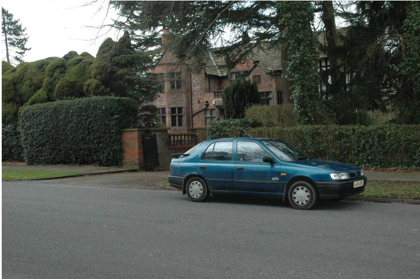
Image 17: Recce/research for the work: The Nissan parked outside the former home of the late Henry Royce, co-founder of Rolls Royce, Knutsford