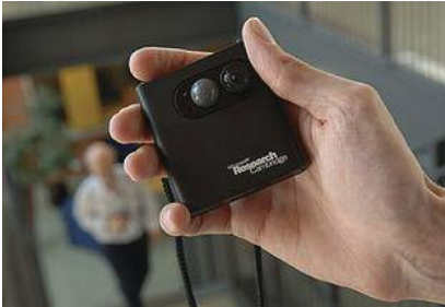
Figure 1: SenseCam.