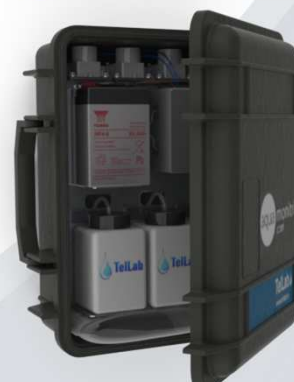
TellLabs Aqua Monitrix System (Targets: Nitrate, Nitrite, pH, Chemical Oxygen Demand)