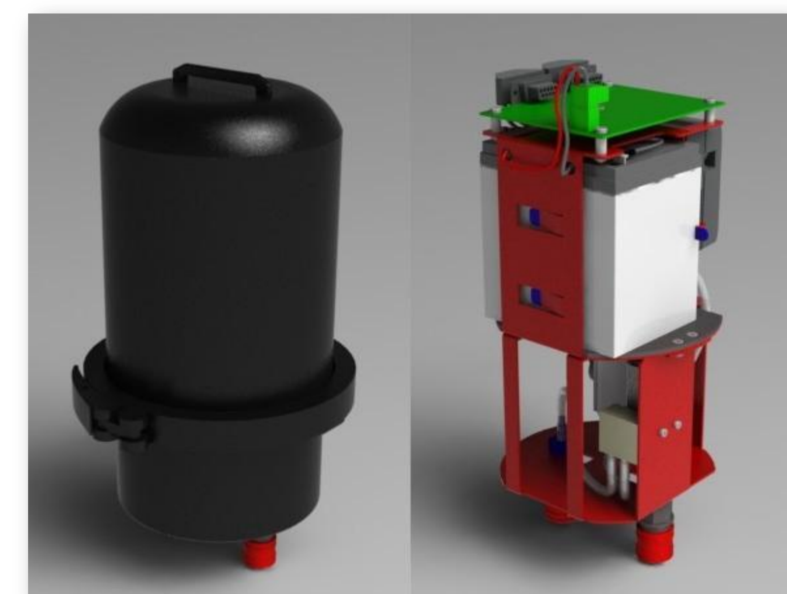
Figure 2. Close-up of the new generation system, right without IP68 casing