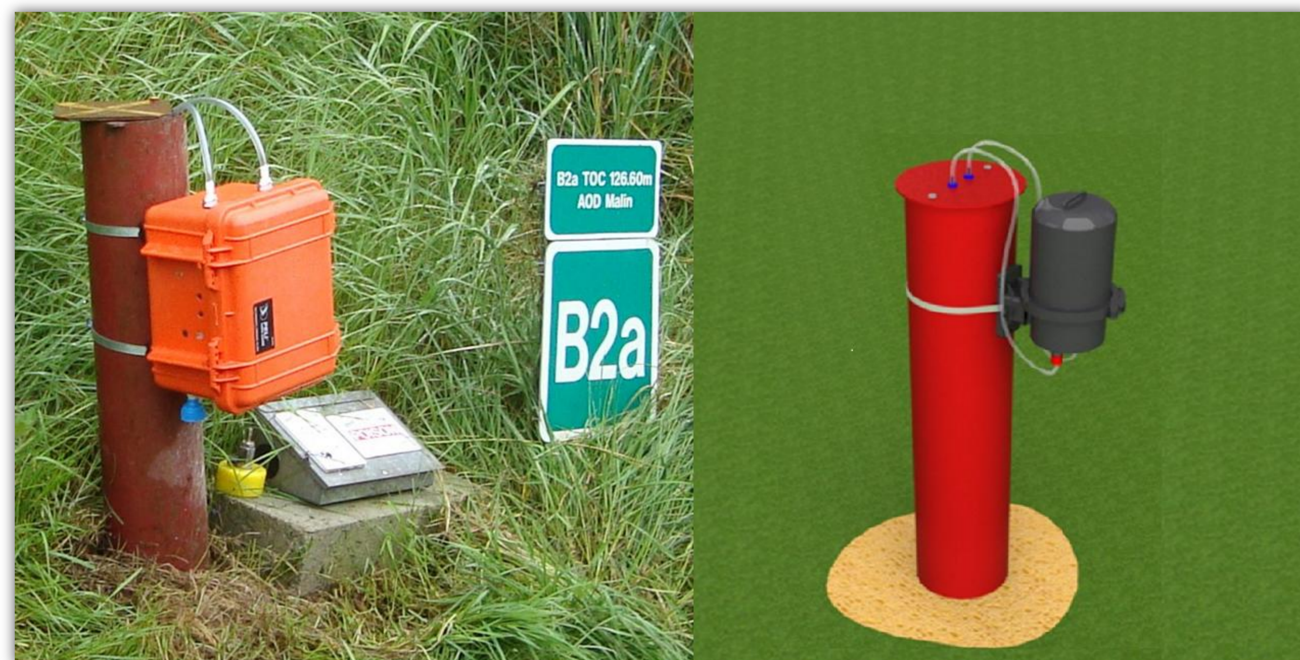
Figure 1. Left is a field deployed system, monitoring gas migration on a perimeter borehole well, right is a visualisation of the newer system in situ