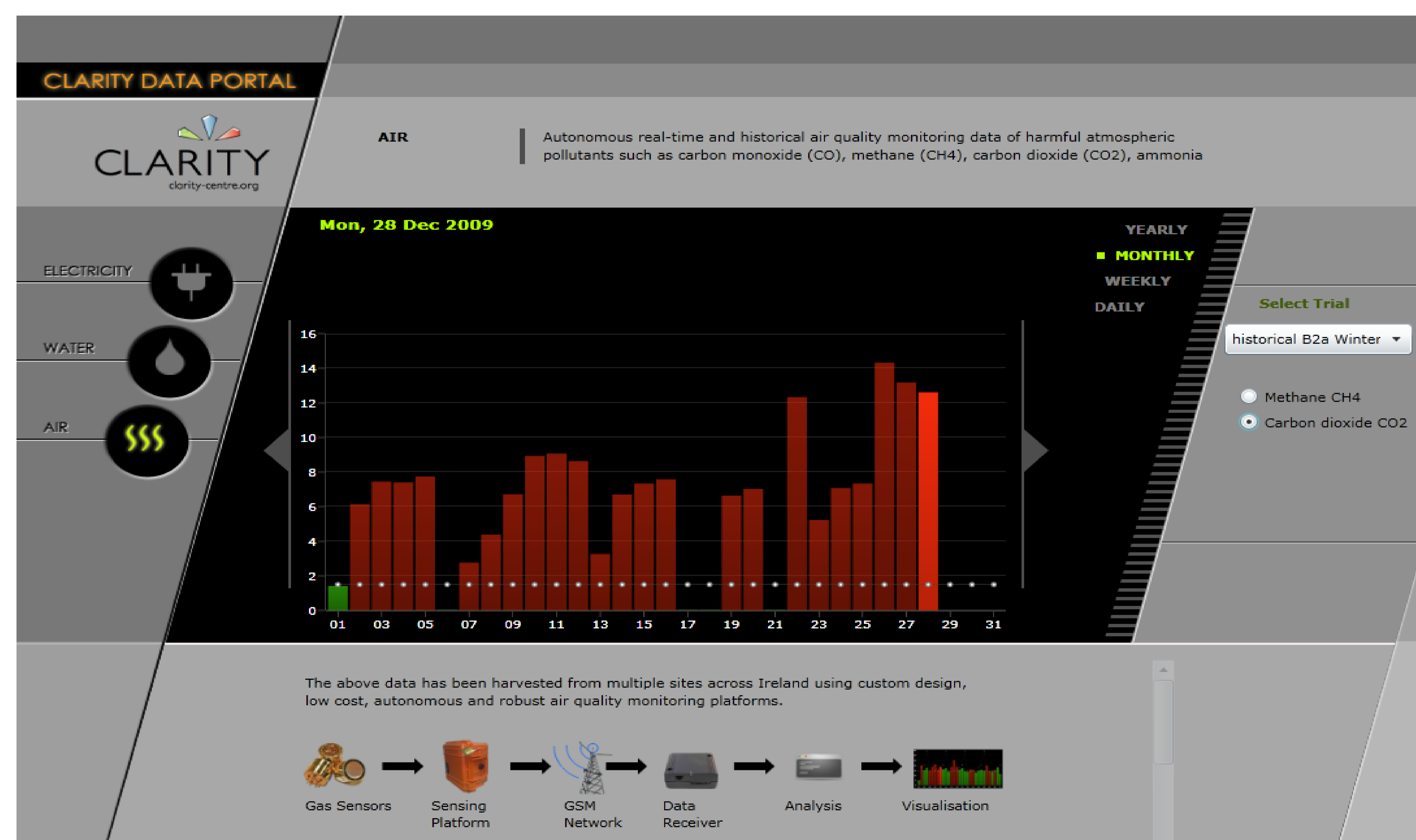
Figure 3. Live updating web based Microsoft Silverlight based data interface [3]