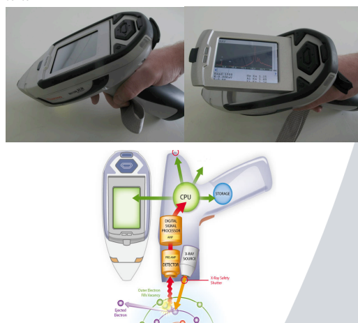
Fig. 3 The XRF handheld analyzer (left), The elemental composition is available immediately after measurement on the build in display (right). The XRF gun's principle of operation (bottom).

The Niton handheld X-Ray Fluorescence analyzer can easily read the concentrations of metal elements in the sample and therefore the 'hidden code' in the retrieved tag on site. It is portable and can be fitted with a wireless connection device.