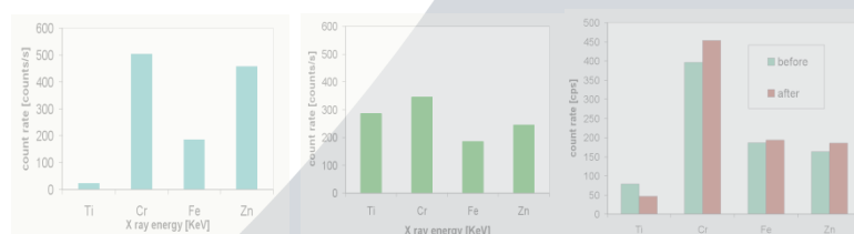
Fig. 4 Two codes formed by combining S1,S2 and S3 in 1:5:5 (left) and 3:2:1 (centre) weight ratios. Spectral fingerprint pattern after mixing the 1:5.5 tag with ethyl cellulose and retrieval by washing with water and magnetic separation (right)

The codes were formed by combining samples S1, S2 and S3 powders in different weight ratios. The powders were then analyzed with the XRF gun to see if the spectral patterns differ from one another. The spectral patterns were stable between measurements. However leaching was observed in the powder that was dispersed and retrieved. It appeared that the titanium component of S1 was partially washed away. That explains the pattern behaviour. Ti peak decreased while other peaks increase because as there is less Ti in the retrieved powder sample more S2 and S3 take its place.