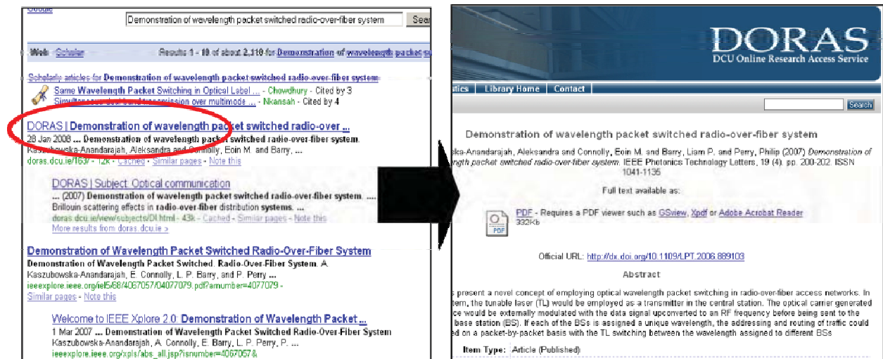
Figure 2: Google search for the title of a journal article that is available in DORAS (at http://doras.dcu.ie/163/ )

Figure 2 shows an example of one of the searches carried out in Google. The journal article title, Demonstration of wavelength packet switched radio-over-fiber system , was inputted in the search engine. In this search, DORAS was the top hit on the search results page. Significantly, DORAS ranked higher than the journal publisher’s website.