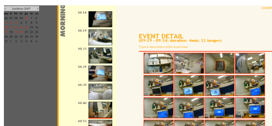
Figure 2 SenseCam browser

To help review this collection of data, the segmented image collections were presented within an event-based browser (illustrated in Figure 2), which allowed the selection of an individual event of interest and the display of its constituent images. As these images are temporally consistent they will often 'storyboard' the progression of a task or operation. This 'storyboard' offers the practitioner a means by which specific elements of a task and its progression can be easily probed and discussed with the participant. The tool also offered a means by which discussion could be focused around particular instances or interactions and a means by which both the participant and the practitioner could better illustrate their discussion with concrete examples. As such, the SenseCam images, as a visual account of tasks a participant carried out, and their segmentation into 'events' proved very useful within post-observation discussions and/or follow-up interviews.