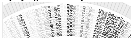
Figure 3. Visualising familiarity by transparency.

In our visualisation, we represent each device as a node within a concentric radial layout. As the hardware ID of the device is unique, we use this to identify it within the visualisation, despite the fact it is not designed to be human readable. It is however chosen instead of a friendly name as if the encounters are too low for a given device, there may be no recorded friendly name, or as friendly names may be changed at any point, there may be more than one to choose from. As such, employing the friendly name to label and identify a device within the visualisation could present problems in selecting a representative name for that device.