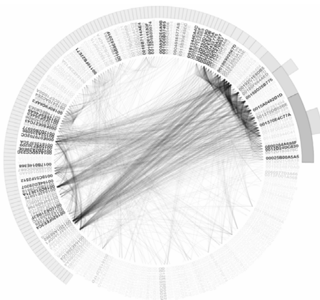
Figure 4. A Bluetooth Visualisation displaying 10 days data for one device. (Inset: tooltip to inquire on the friendly name)

The display of friendly names adapts the DocuBurst technique to the domain, but preserves the visual richness of the technique (see Figure 4.) In our approach the depth of child nodes conveys the number of friendly names recorded for a given device. This provides visual insight into the frequency of change for friendly names, an infrequent but important occurrence. Additionally, the wedged radial approach provide an excellent means to rapidly gain an overview of friendly name usage within the dataset and the amount of overlap that exists between encountered devices’ friendly names. Large friendly name wedges represent friendly names which are commonly found within the dataset and which span multiple devices. Overlapping friendly names can cause difficulty in identifying the intended device for interaction [7] and the visualisation allows the viewer to visually determine how problematic this may be within the dataset. Also, gaps in the radial burst will indicate where no friendly name has been