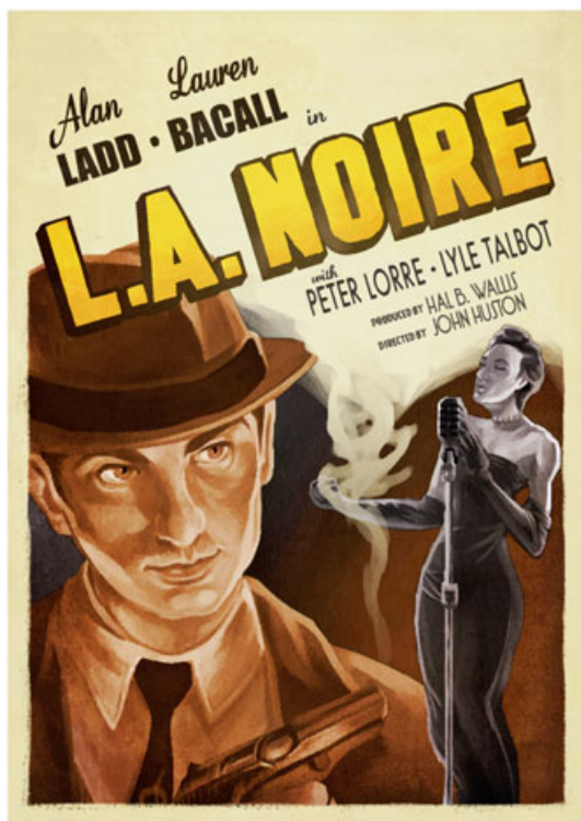
Figure 1: Extended textual fields

“Often, and this has been central to English teaching, the category (literature) includes only what ‘adult’ experts believe that young adults should read. The ‘literariness’ of the texts deemed appropriate in this category, often taken for granted within particular regimes of value, needs to be a matter for explicit debate rather than assumed to be a legitimate criteria of inclusion” (Richards, 2011, p. 18).