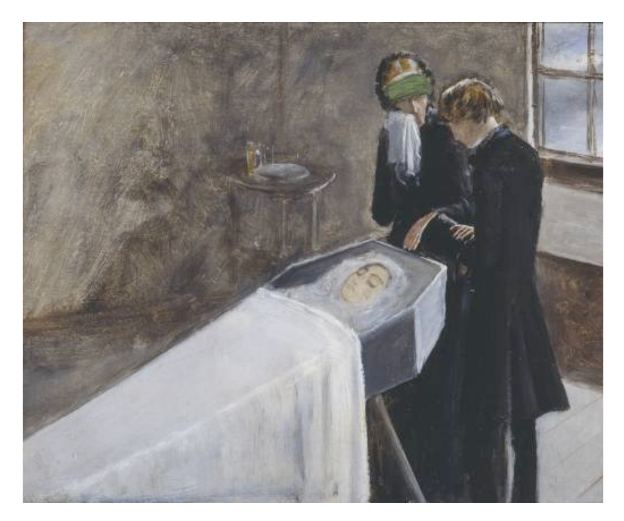
Figure 2: John Everett Millais, The Artist Attending the Mourning of a Young Girl

The image of Alfred is small: cartes-de-visite photographs were mounted on pieces of card only 2.5 x 4 inches large. The carte-de-visite photograph was developed in the 1850s by Antoine Disdéri, whose invention of a camera that could take multiple images on one plate led to the a huge reduction in the price of photographs. Cartes de visite were socalled because their size was close to that of a visiting card, but they were most often collected and placed in albums. Cartes attained a huge popularity through the 1850s and 60s, when photographs of the famous sold commercially for as little as one shilling. Studies of the carte-de-visite craze often focus on this aspect of carte photography, yet it was also hugely popular for family portraiture, largely because it was so cheap. Cartesde-visite, and their slightly larger successor, cabinet photographs, were collected into family albums and recorded family members and occasions such as christenings and marriages (Newhall 64-71). Historians of family photography such as Audrey Linkman have noted that post-mortem photographs are only very occasionally found in such albums as survive, although there are suggestions that post-mortem portraits may have been circulated among friends and relatives in the same way as other carte-de-visite or cabinet portrait photographs were (Linkman 342-7). The lack of pictures of the dead in