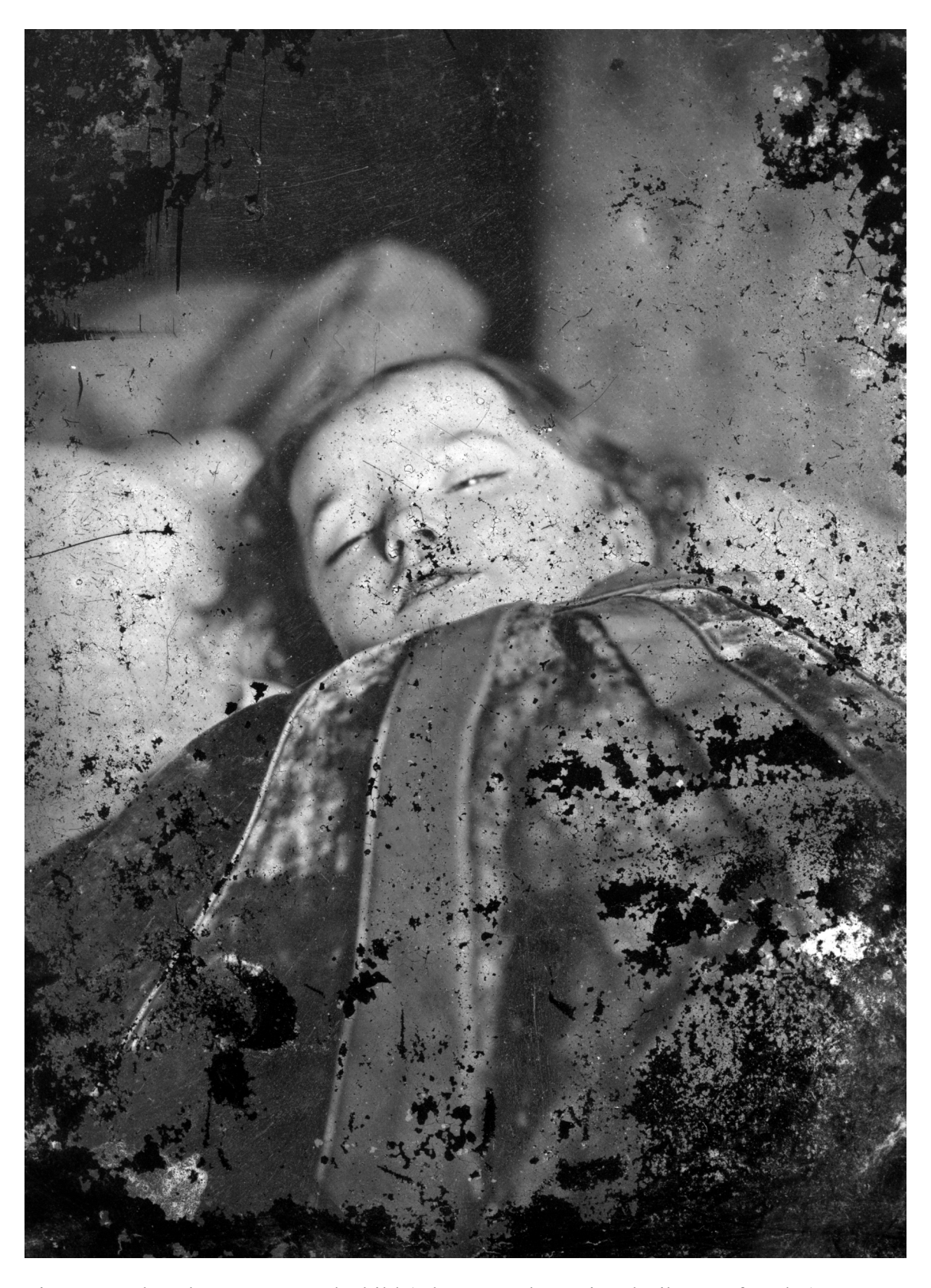
Figure 4: John Thomas, A Dead Child