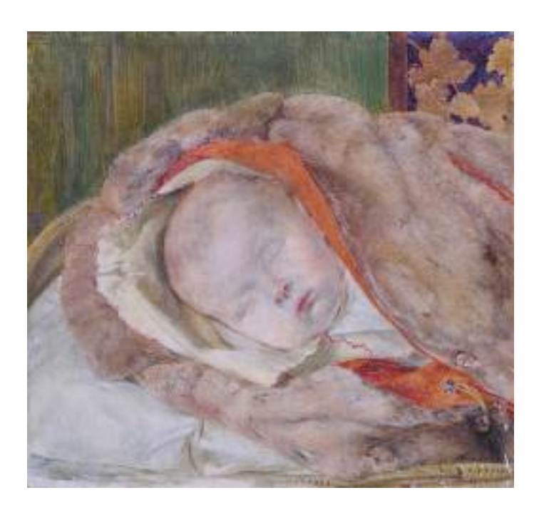
Figure 3: William Windus, Portrait of a Dead Child, the Artist's Son

waistcoat he is wrapped in underneath the coat, and which curves round his head, and in the green wall behind the piece of inlaid furniture to the right. The child's face is at the centre of the image, and the swathes of cloth and coat wrapping him serve to frame it, directing the viewer's gaze to its tiny features. The picture is intensely poignant: the chill of death is emphasised by the fur coat and the contrast between the child's closed eyes and pale skin and the luxuriance of the fur and fabrics surrounding him. The picture must have been painted, or at least started, in the first hours after death, so in one sense its point is the intensity of grief to which it gives visual form. Yet there is also an aesthetic at work here, for the careful arrangement of contrasting colours and textures surrounding and framing the dead child's face emphasise that we are meant to find it beautiful: not only the picture, but also the dead child.