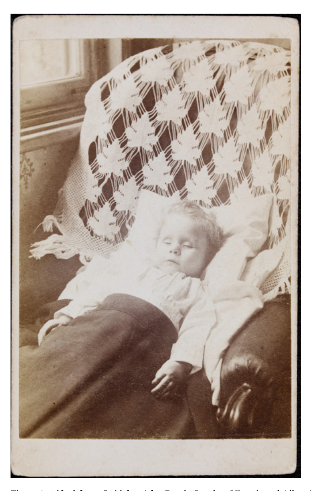
Figure 1: Alfred Owen Laid Out After Death (London, Victoria and Albert Museum)