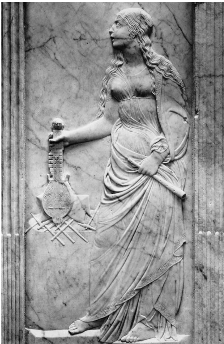
FIG. 48: Agostino di Duccio, Music , marble relief, from the left pilaster of the Chapel of the Muses, Tempio Malatestiano, Rimini, c.1450–1457.