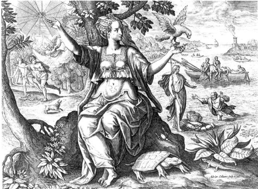
FIG. 43: Martin de Vos, Adrian Collaert, The Sense of Touch , engraving, Antwerp 1575, London, private collection.

is part of the narrative, rather than its explicit subject. 12 Martin de Vos's print deploys religious subjects to illustrate the individual senses, while the main allegorical figure echoes the theme of the pecking goldfinch that the Child Christ often holds in medieval painting. 13