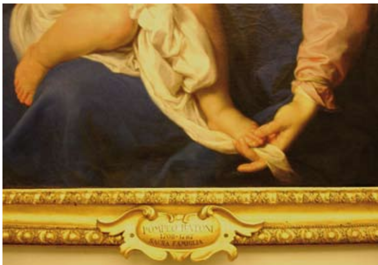
FIG. 46: Pompeo Batoni, Holy Family , oil on canvas, c.1774 (detail); Museo Capitolino, Rome (inv. 359).