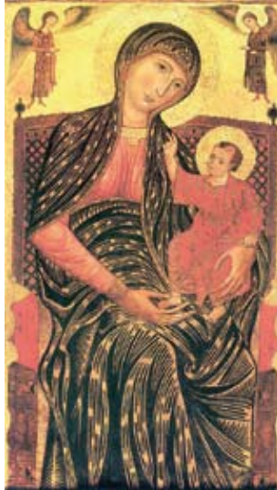
FIG. 44: Magdalene Master, Virgin and Child , tempera and gilding on panel, c.1260–1270; Gemäldegalerie, Berlin (inv. 1663).

painters of the fourteenth century. 27 The rise of relief as an essential part of painting would seem to follow this broad trend. We find it already in Cennino Cennini's Libro dell'arte and it was developed later by Leonardo and his followers through the sophisticated pictorial treatment of colour, light and shadows. 28 While methods of representation underwent dramatic changes over the course of the Renaissance, in the case of the Virgin and Child , the same tactile iconographic themes remained.