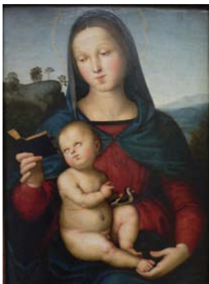
FIG. 45: Raphael, Virgin and Child , oil on panel, c.1502; Gemäldegalerie, Berlin (inv. 141).