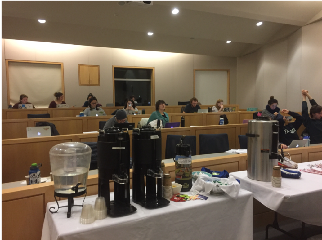
Davis Family Library