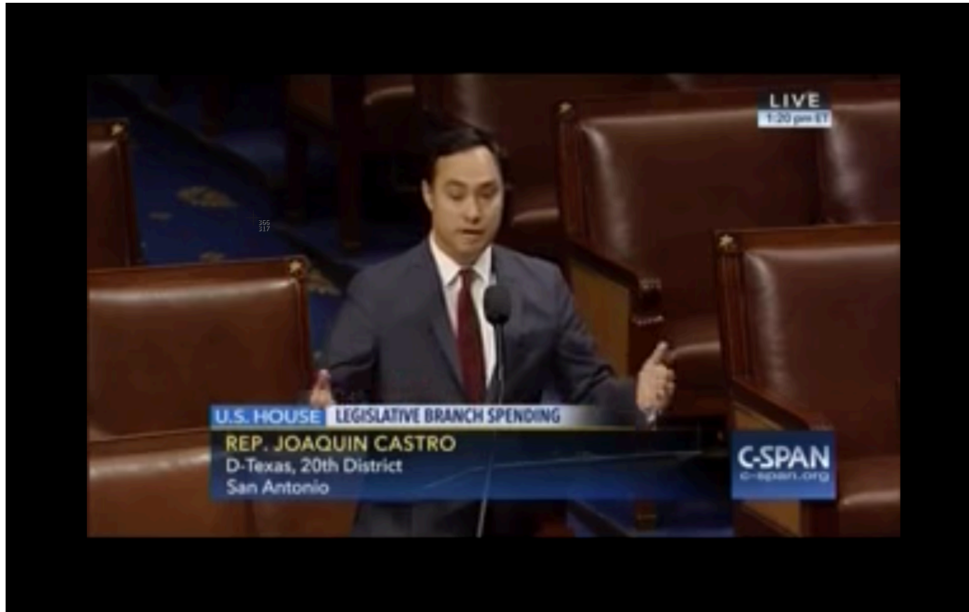
Rep. Joaquín Castro, (D-TX)