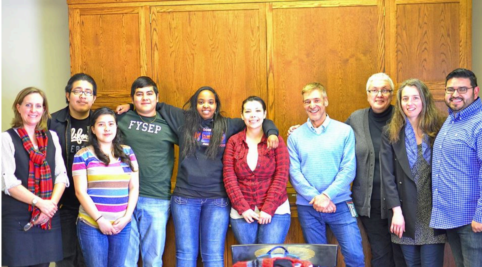
3/24/14 meeting: CoFIRED students, librarians, deans