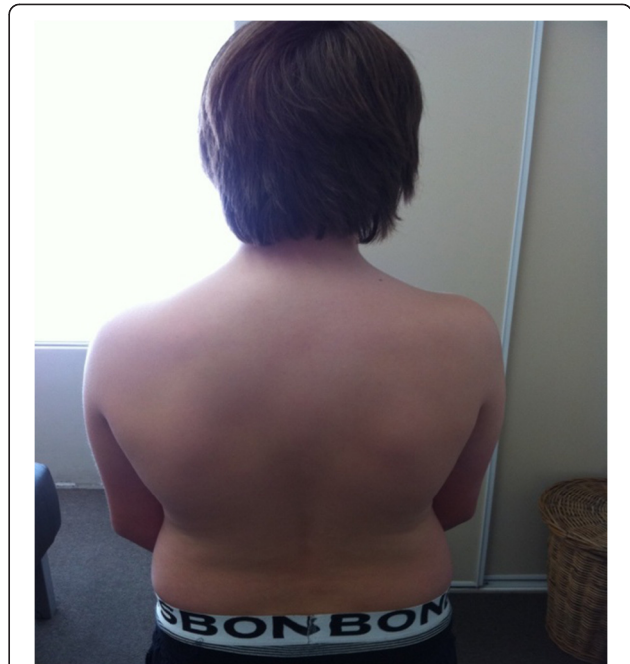
Figure 1 Posterior view of patient in neutral lumbar ROM. The posterior view shows a non-distressed young male with no visible scoliosis or antalgia.

Bilateral lower limb neurological examination was unremarkable, revealing 2+ patellar and achilles reflexes, intact sensation to light touch of L1 to S2 dermatomes, and 5/5 motor testing of L4 to S1 myotomes. Supine examination revealed a Straight Leg Raise (SLR) test that was negative for lower limb radicular pain production, and limited to 45 degrees bilaterally due to significant