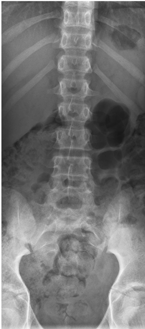
Figure 4 Antero-posterior X-ray lumbar view. Note the absence of scoliosis.

findings, as well as a recommendation to the mother that her son attends the additional opinion of a paediatric spine specialist for co-management. The short and long term prognosis of this patient's low back condition was of utmost importance, particularly as the patient was already in initial stages of puberty and therefore his growth will be highly accelerated in the following years. His analgesia and chronic low back pain were significantly affecting his quality of life, and his chronic use of