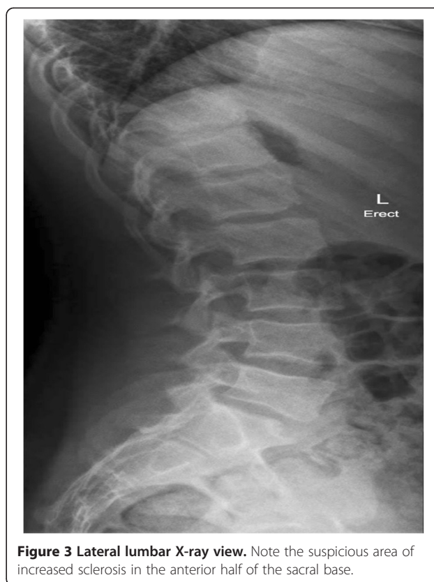
Figure 3 Lateral lumbar X-ray view. Note the suspicious area of increased sclerosis in the anterior half of the sacral base.

The patient was subsequently referred for MRI examination of the lumbar spine by the chiropractor to a private facility on the second visit to assess for lower