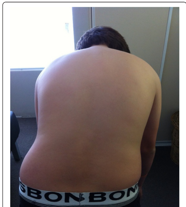
Figure 2 Posterior view of patient in end-range active flexion lumbar ROM. This movement reproduced his LBP and created an abnormal right lateral lumbar deviation, appearing to be a possible lumbar sciotic curve.