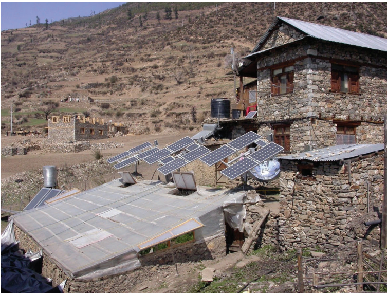
FIGURE 3 External view of HARS Greenhouse.

its expansion to the “Family of 4 PLUS,” which includes health and food supply initiatives. As part of the latter, RIDS-Nepal has constructed a number of greenhouses in Humla. Their first greenhouse, built in 2004, is located at their High Altitude Research Station (HARS) in Simikot, the main town of Humla (3000 m altitude).