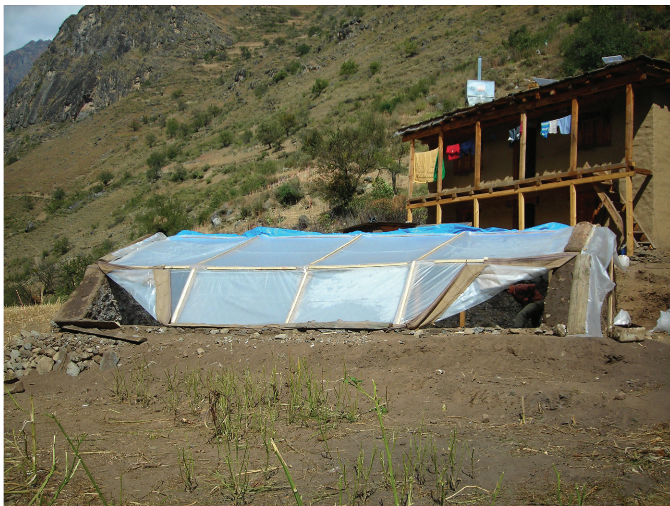
FIGURE 4 GERES-style greenhouse at Dharapori.

on measured hourly climatic data for 1 week in November. The validated model was then used to investigate options to improve the thermal performance of the greenhouse. The measurements showed that, in mid January during the night time, the subsurface soil temperatures within the greenhouse were approximately 7–9°C warmer than at a similar soil level outside. At 600 mm below the surface, the soil temperature in the greenhouse did not fall below 10.3°C. Air temperatures within the greenhouse in mid January were approximately 7.5°C above the outside air temperature. Although not ideal, the measurements over the winter months indicated that the growing conditions were certainly suitable for some vegetable crops such as spinach, carrots, and beans.