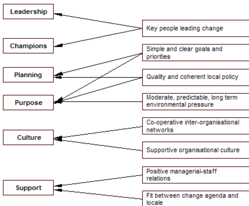
Figure 2. Mapping of CCP Success Factors on Characteristics of Change

The three change management approaches — top-down, bottom-up, and middle-out — are compared in this section by applying six characteristics of change management strategies identified in this study, and which were derived from the eight success factors identified in the Context, Content, and Process model. The links between the eight CCP success factors and the six characteristics used in this study are shown in Figure 2. The relevance of each of the six characteristics to the three approaches is discussed below with reference to the literature on change management.