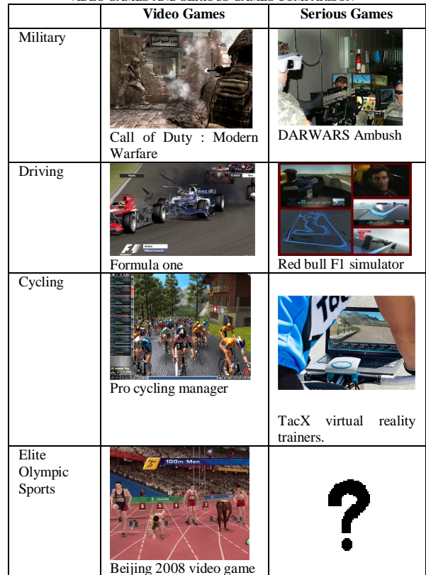
TABLE I VIDEO GAMES AND SERIOUS GAMES COMPARISON