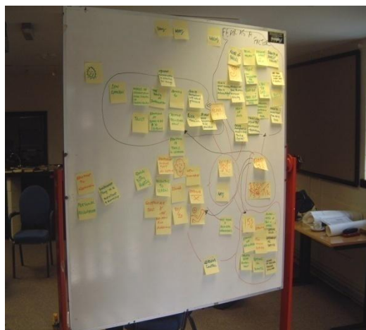
Figure 4: Stick-it labels permit mobility of space usage, people and information.

A technological response seen and advocated for offices is often the, large, supposedly interactive screen or whiteboard sometimes positioned horizontally as a table. This we would suggest removes or reduces an important element of the kinaesthetic walk. One of us has seen magnetic walls used to similar effect but the use of floors so that groups can walk through their model of the system helps release more insights and stories (Figure 5).