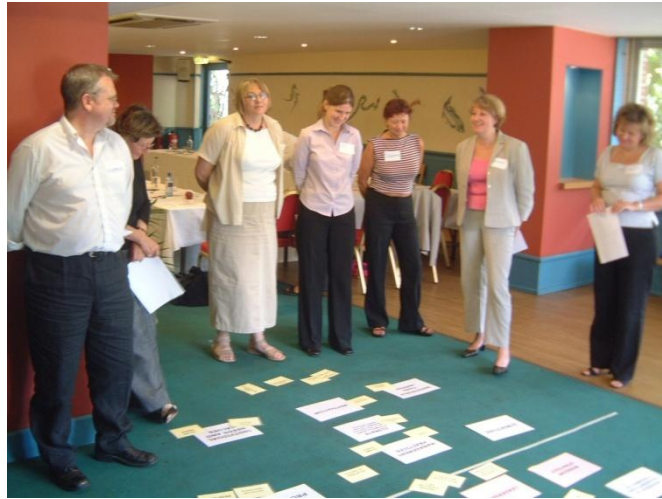
Figure 5: Floor space: mobility of space usage, people and information.