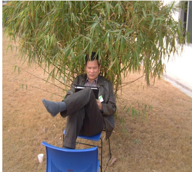
Figure 3: Coffee and papers in action

The Senior Executive pictured in China admitted his pleasure at effectively being given permission to experience an extended period of thinking/concentrating . The place signifies that time for concentration is important and a legitimate extension of work. FMs concerned with new workplaces, and the various barriers to change thrown up by organisational culture (e.g. Becker, 2007) might find a coffee and papers approach a pragmatic means of gaining executive buy in to the strategic possibilities inherent in new workplaces.