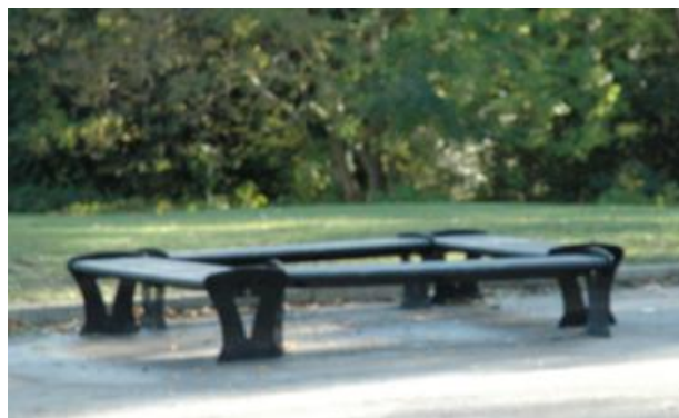
Figure 6. Spontaneous creation of a group space by school pupils (from Author B et al 2009)

So far we have phrased the discussion around corporate spaces. Similar lessons should inform the design of schools (Author B et al., 2009). That research (online address to follow) traced pupils' views of the physical space, and its condition, in an old school awaiting an extensive refurbishment and a four year old new build. The desire for, and lack of, reflective and social learning space was strongly and eloquently expressed. Pupils even took matters into their own hands rearranging outdoor seating (Figure 6). In subsequent surveys pupils rated social spaces as being as important as classroom in affecting their learning.