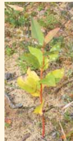
Figure 2: Growth and vigour responses of tuart seedlings to different restoration treatments. Healthy robust seedling (left) and nutrient stressed seedling (right).