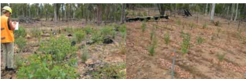
Figure 4a and 4b: Growth and vigour responses of tuart and associated understorey species on an ashbed (a) and on a ripped site (b)